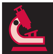
Applied Research/ Testing Laboratory