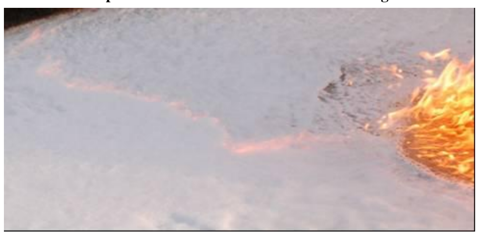
Figure 2. Transient "ghost flame" sweeping across foam-covered surface in gasoline burn back test. Such flames occur periodically before sustained ignition