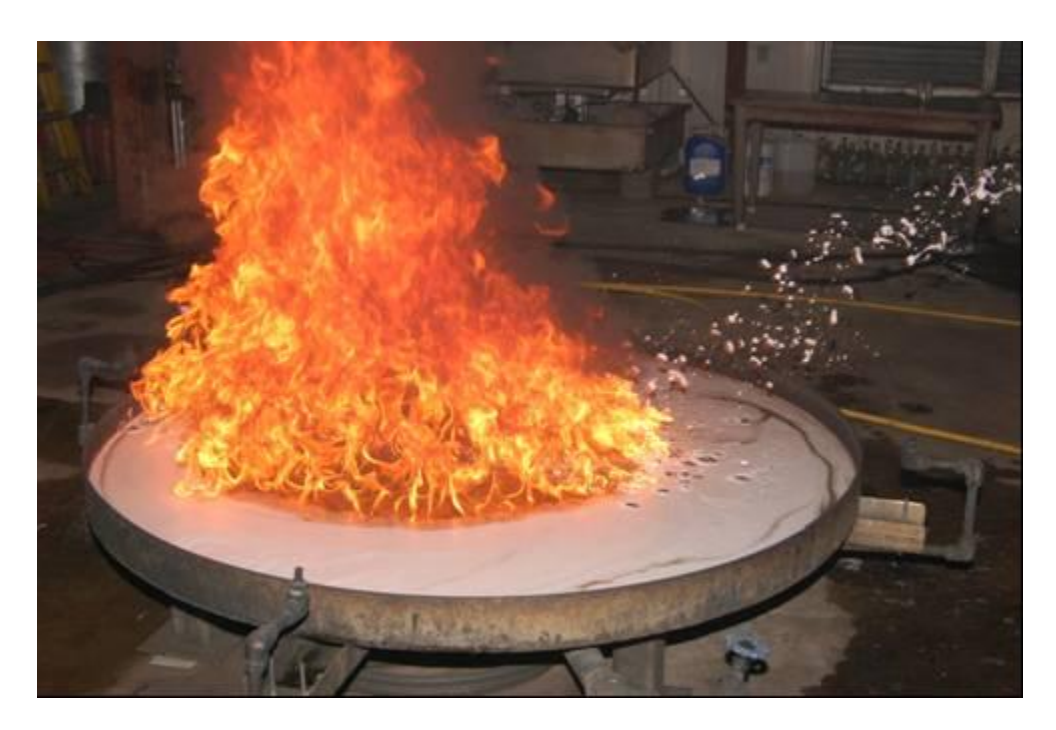
Figure 3. End of burn back test with JP-5. Unlike the gasoline test, the fire is confined to a well-defined foam-free area of the fuel surface. The foam-covered region does not have flames isolated from the main fire.

Figure 4 shows a burn back test with biodiesel. For this fuel the burn back is generally similar to that for JP-5, but with one noteworthy difference. The flames do not cover the entire foam-free region as happens in the JP-5 tests. Rather, there is a "standoff" distance of several inches between the edge of the foam and the flaming region. This is probably due to the flash point being substantially higher than the boiling point of water, so that a flammable concentration of fuel vapor and an aqueous foam cannot coexist. One consequence of the fact that the flame cannot closely approach the foam boundary is that the burn back time for biodiesel is much longer than for JP-5.