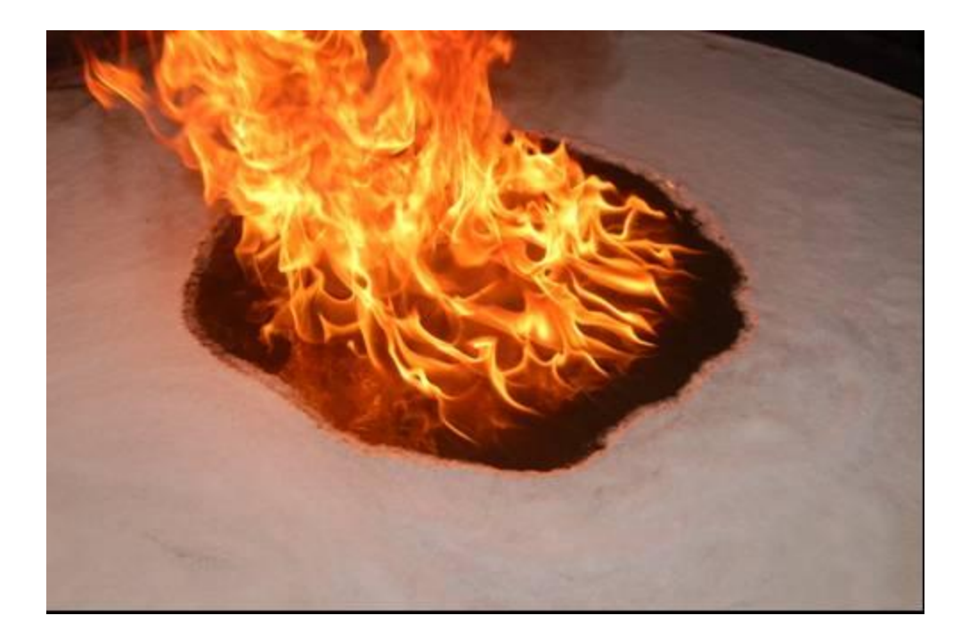
Figure 4. Burn back test on biodiesel. Unlike the JP-5 burn back, in which the entire foam-free area is covered by flames, in this test there is a "standoff distance" between the flame and the edge of the foam-covered area.

When AFFF is applied to a gasoline pool, it forms an aqueous film layer and a foam layer. These layers act as a vapor barrier which inhibits, but does not completely prevent, formation of a flammable mixture above the foam layer. With gasoline, enough vapor can pass through the foam to produce a flammable mixture even in the absence of an external heat source. This vapor mixture is ignited from the burn back starter pan causing flames to erupt above the foam. These transient "ghost flames" sweep across the top of the pan. As the foam layer erodes, the rate of vapor penetration increases, allowing steady flames to appear even though the pool is still nominally covered with foam.