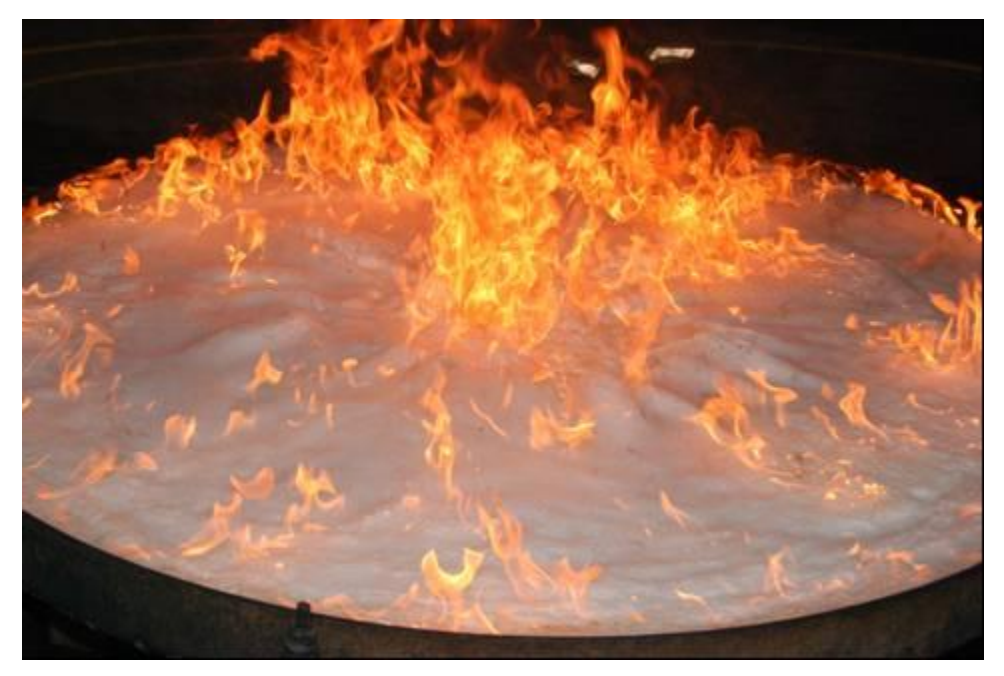
Figure 1. Burn back test on gasoline, showing spread of flames over the foam-covered region.