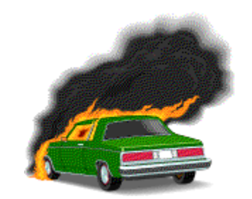
One highway vehicle fire was reported every 181 seconds .