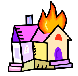
One home structure fire was reported every 86 seconds .