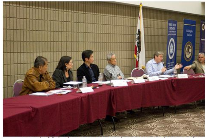
A panel of federal agency representatives answer workers' questions at a listening session held in Carson City, California.