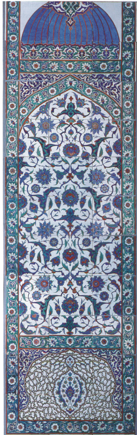
Fig. 12. Tile panel, probably from the Edirne Palace, reconstituted by the Benaki Museum (original tiles: Benaki Museum, Museum of the Calouste Gulbenkian Foundation. The remaining part of the panel reproduces tiles at the Victoria & Albert Museum and the Vienna Museum für Angewandte Kunst), Iznik, ca. 1570-1574.

tiles from the middle of the large panels, especially if they have no border designs which are easier to match up, is far more difficult. The work is made easier when the researcher is able to scan research photographs made over many decades, and then to re-create them in the same scale digitally, and then to attempt to put them together in much the same way as a picture-puzzle, but with all of the 'pieces' being the same shape and size. In working with literally thousands of slides taken in museums all over the world, I was able by the mid-1990s to identify a significant number of dispersed unified-field panels, but two of these were by far the most interesting. Juxtaposition of individual tiles and small groups of adjoining tiles from the Benaki Museum, the Calouste Sarkis Gulbenkian Museum, the Museum für Angewandte Kunst, the Victoria & Albert Museum, and the Metropolitan Museum led to a digital reassembly first discussed by the author at a Turkish art conference in Utrecht in 1999. Additional work by the Benaki Museum staff led to a more refined digital assembly of what was originally none identical panel of tiles (fig. 12), an unprecedented