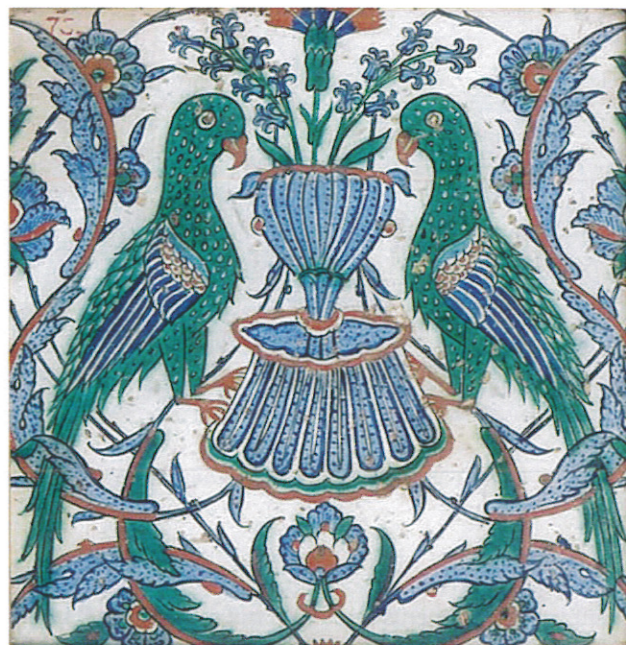
Fig. 6. Tiles with confronted birds, Iznik, ca. 1570-1580. Athens, Benaki Museum, inv. no. 75.

into adjacent tiles (fig. 3). One quite exceptional pattern from the mosque of Rüstem Pasha in Istanbul, found early in the development of polychrome Iznik mural ceramics, is notable both for the asymmetry of its design and for repeating only in a horizontal direction (fig. 4). Smaller groups of mass-produced tiles were made with self-contained symmetrical designs, usually consisting of bouquets of flowers, self-contained cusped roundels (fig. 5) or even two confronting birds (fig. 6).