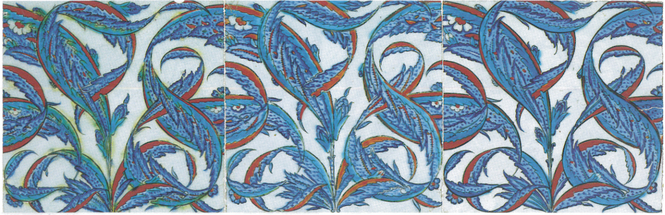
Fig. 4. Tiles with horizontally continuing pattern, from Rüstem Pasha Mosque in Istanbul, Iznik, ca. 1560.

looting of monuments remains a major threat in Turkey today, and the aftermath of the most recent earthquakes in north-west Turkey appears to have produced yet another round of looting of Iznik tiles. 6