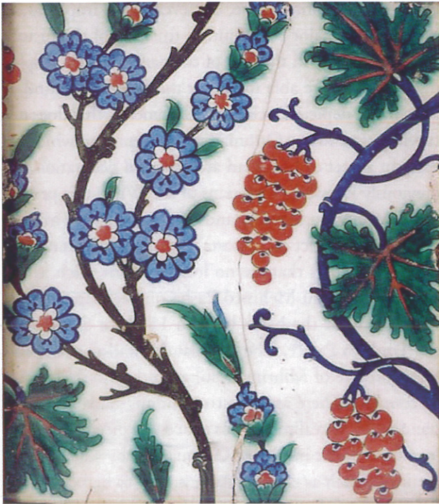
Fig. 11. Tile from the mosque of Takieci Ibrahim Aga in Istanbul, Iznik, ca. 1590. Athens, Benaki Museum, inv. no. 11166.

tiles from the middle of the large panels, especially if they have no border designs which are easier to match up, is far more difficult. The work is made easier when the researcher is able to scan research photographs made over many decades, and then to re-create them in the same scale digitally, and then to attempt to put them together in much the same way as a picture-puzzle, but with all of the 'pieces' being the same shape and size. In working with literally thousands of slides taken in museums all over the world, I was able by the mid-1990s to identify a significant number of dispersed unified-field panels, but two of these were by far the most interesting. Juxtaposition of individual tiles and small groups of adjoining tiles from the Benaki Museum, the Calouste Sarkis Gulbenkian Museum, the Museum für Angewandte Kunst, the Victoria & Albert Museum, and the Metropolitan Museum led to a digital reassembly first discussed by the author at a Turkish art conference in Utrecht in 1999. Additional work by the Benaki Museum staff led to a more refined digital assembly of what was originally none identical panel of tiles (fig. 12), an unprecedented