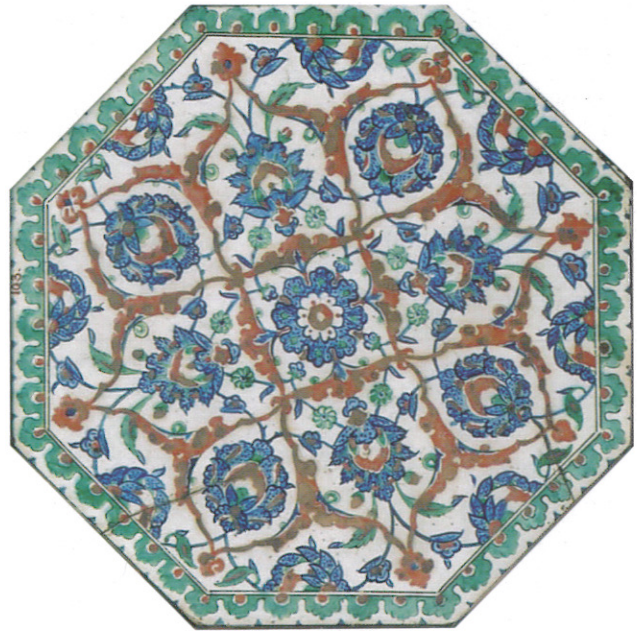
Fig. 9. Large octagonal tile, Iznik, ca. 1560-1570. Athens, Benaki Museum, inv. no. 103.