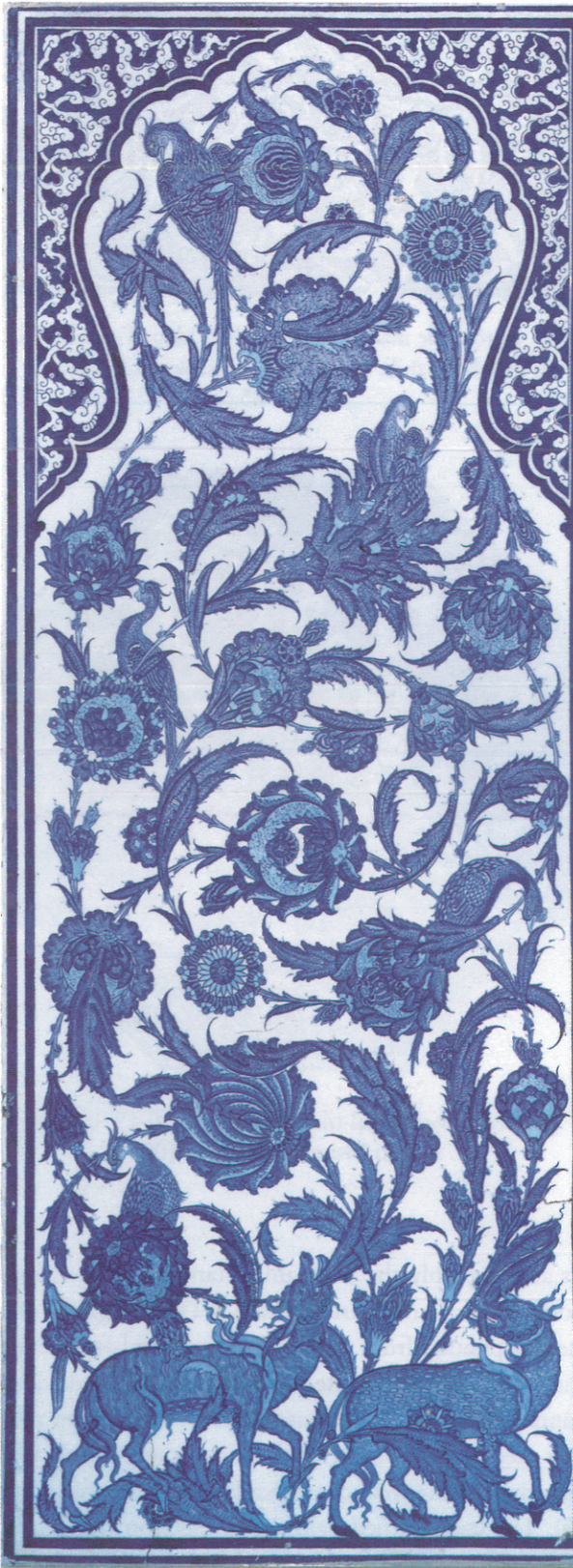
Fig. 10. Large tile with design after Shah Kulu, from Sünnet Odasi, Topkapi Palace in Istanbul, Iznik, ca. 1550.