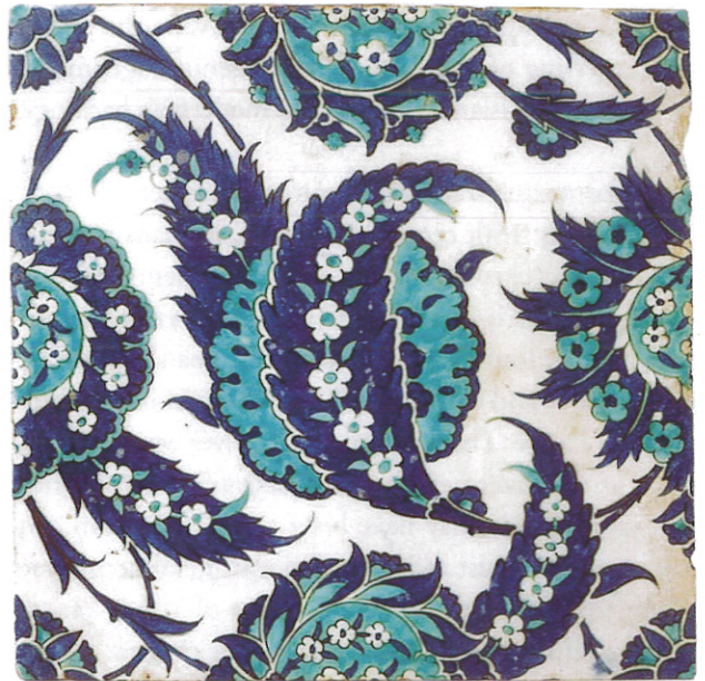
Fig. 3. Tile with asymmetrical central motif, Iznik, ca. 1560. Athens, Benaki Museum, inv. no. 83.