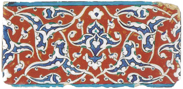
Fig. 8. Border tile made for Murad III Odasi, Topkapi Palace in Istanbul, Iznik, ca. 1580. Athens, Benaki Museum, inv. no. 85.

Unified-field panels—large designs created first as cartoons on huge sheets of paper and then transferred to entire fields of identical rectangular tiles—are the larg-