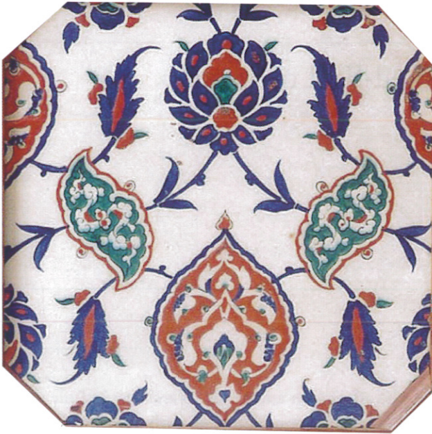
Fig. 1. Tile made for the tomb of Selim I in Istanbul, Iznik, ca. 1574. Athens, Benaki Museum, inv. no. 11157.

were subsequently recycled to other Ottoman monuments, large quantities of such artistic works were purchased by private collectors in Europe and around the Mediterranean; of these, the bulk eventually ended up in museum collections. Visitors today to the Victoria & Albert Museum in London can see numbers of Ottoman tiles from many different monuments in that museum's well-lit galleries of Islamic ceramics. Large panels of Iznik tiles from identifiable monuments were formerly on display in the Musée des arts décoratifs in Paris. Important collections of Iznik tiles relegated to storage are found in other museums, most notably the Louvre in Paris and the Calouste S. Gulbenkian in Lisbon. 5 The collecting of Iznik tiles in Europe during the late 19th and early 20th centuries appears to have received a special impetus from two events: first, the Russo-Turkish War of 1878-1879, with the siege and subsequent occupation of the secondary Ottoman capital city of Edirne, and the destruction of the revetments of its palace; and second, the 1902 earthquake in Istanbul, which took a special toll in monuments near the fault by the city walls at Topkapı and Edirnekapı. As the prices of Iznik tiles have continued to reach very high levels in the marketplace (a place they have maintained for well over a century and a half) the