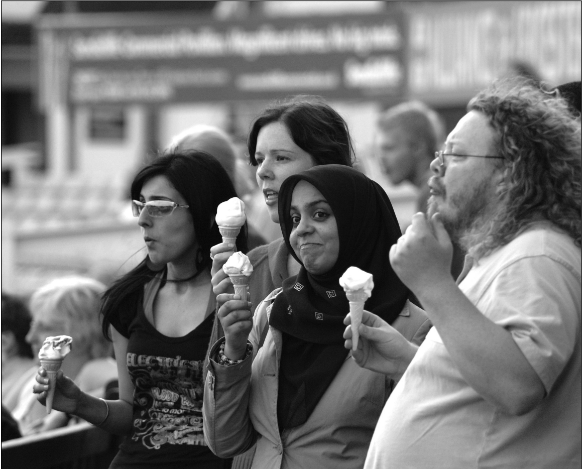
The Clerics Cricket Match, Grace Road 9 November 2006.

ings in London whereby Muslims throughout Europe have been cast as self-selecting outsiders, stereotyped as ‘fundamentalists’ and demonised and feared as the ‘enemy within.’ 54 Muslims continue to feel embattled and besieged, and the stigmatisation of Muslims remains a pre-eminent concern. Considering this perhaps the women chose to emphasise their experiences of Islamophobia to try to convey to an English person the extent to which anti-Muslim sentiment impinged on their lives, in terms both of their restrictions in public space and also in relation to their ambivalence about their sense of belonging in Britain. Indeed, the consequent feelings of anxiety and fear that the women routinely endured was shocking, particularly considering the dominant discourse of Leicester which celebrates the city’s multi-cultural success. 55 Moreover, the women’s stories ultimately challenged stereotypes that white people may possess. Firstly, that Muslim women are disempowered victims, oppressed by their religious and ethnic cultures and, secondly, that the residential segregation