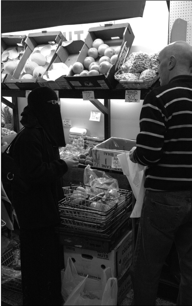
Spinney Hills, Highfields.

Yes. You know the word izzat? You are my pride you cannot do anything wrong because I have to live in the community, I have to face everybody. So just think how much pressure I had to live with. And so what I did, I remember the words so very, very vividly and I remember saying 'Do what you want.' And I walked out. 32