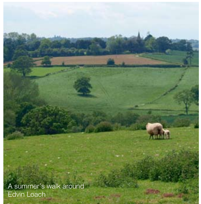
A summer's walk around Edwin Loach

alarm you. Carry on until the lane bends to the right to Tipton Hall. Take the gate on your left by the fuel tank into the field, where the horses made a bee-line for us, so the irate Ludo has to be separated from them by the hedge. Follow the right hand hedge. At the far corner take the right hand gate. Take a line diagonally north west to a strip of woodland. As I pause to let the dogs away, in this vacant field, I admire the sheep scattered fields and the rising hills toward Lower Sapey.