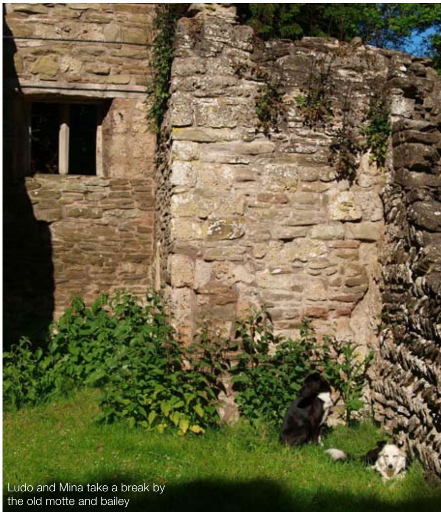
Ludo and Mina take a break by the old motte and bailey