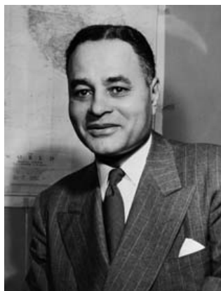
Ralph Johnson Bunche, elected 1951.