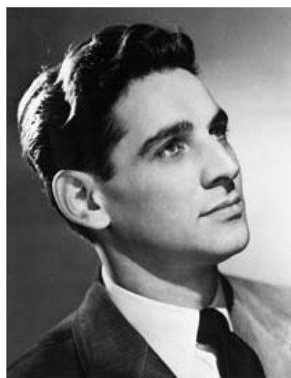
Leonard Bernstein, elected 1951.