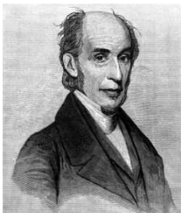
Charles Bulfinch, elected 1791.