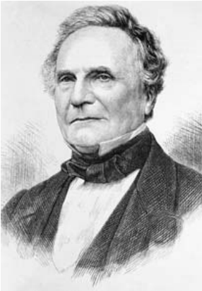
Charles Babbage, elected 1832, FHM.