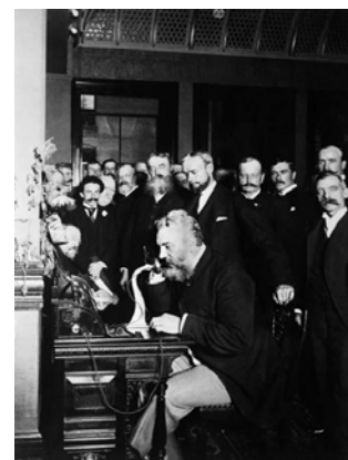
Alexander Graham Bell, elected 1877.

Career description: Historian; Clergy member