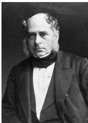
Henry Bessemer, elected 1895, FHM.