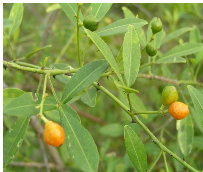
Figure 1: Floral parts of Toddalia aculeata ; (a) leaves and flowers (b) fruits