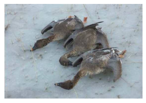
Bean Geese killed by the poison Furadan (C_{12}H_{15}NO_3) in Liaoning Province, March 2012