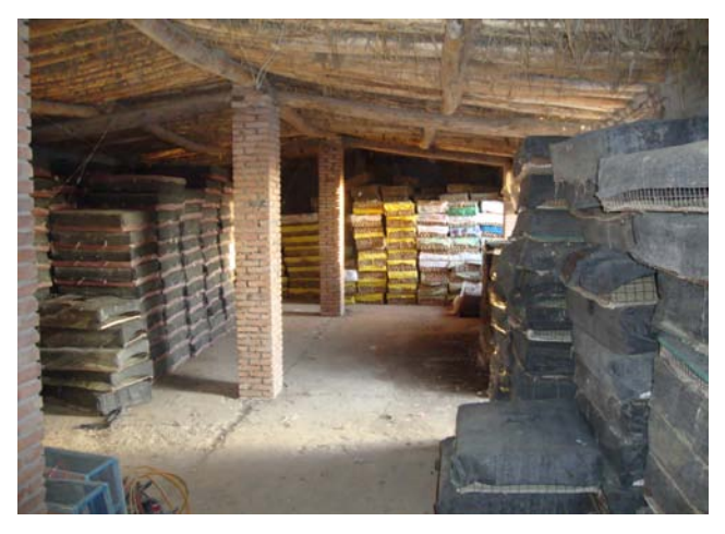
Aircraft cargo warehouse and dens of wild geese and ducks near Urumqi, there are about 600 cages and one cage can be loaded with 10 ducks