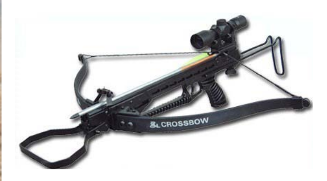
Fig. 4. Crossbow like it is used for waterbird hunting

been recently used to shoot geese and ducks. Such events have been reported by newspapers in northeast China many times. Many advanced crossbows can be bought via the internet at present.