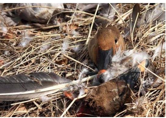
Bean Geese killed by local poachers in Liaoning Province, March 2012