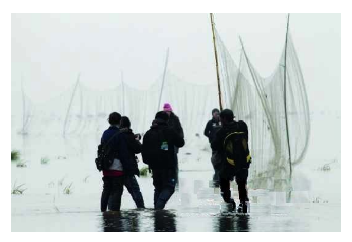
Special large-scale poaching activities with impunity in the Poyang Lake (The information from local newspaper and network)