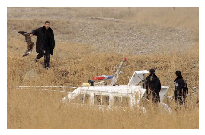
The local police driving a speedboat to hunt raptors with guns in wetlands of the south of Xinjiang, March 2012