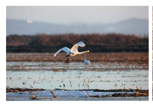
A swan with steel trap in Liaoning Province, March 2012