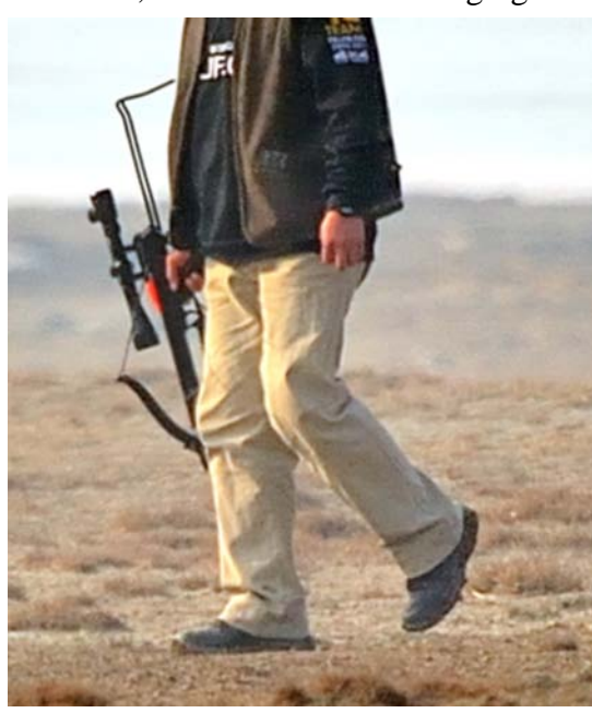
Fig. 3. Cross-bow hunting near Urumqi, March 2012

Because guns cannot be used by the public, some hunters have resorted to using a crossbow, which is a more damaging weapon than a bow and arrow. The cross-bow has