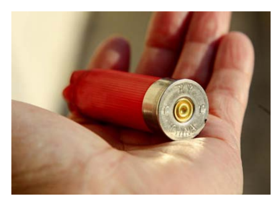
Fig. 2. Hunting in Liaoning, March 2012

The shooting of wild geese by policemen was recorded in Xinjiang in March 2011. Cases involving soldiers poaching geese on the islands near Shandong Province have also been documented. A special gun, called a ,blunderbus', was also used during hunting around lakes. Tens of firearms were set on a board side by side and over a hundred steel balls could be shot from these firearms at one time. Dozens of passing geese may be hit at once, giving the potential to be very destructive.