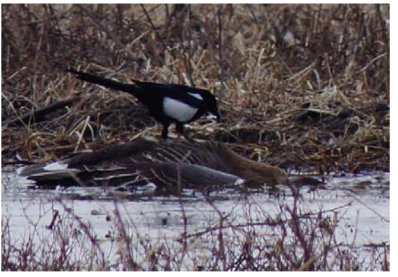
Bean Goose killed by poison in Liaoning Province, March 2012