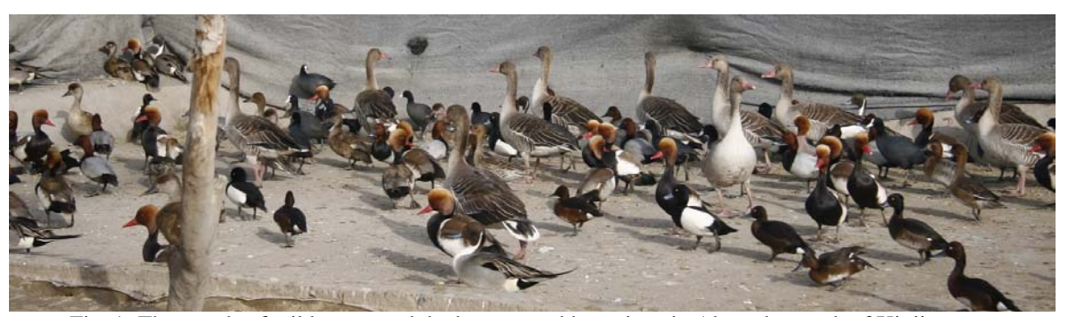
Fig. 1. Thousands of wild geese and ducks captured by poison in Aksu, the south of Xinjiang, 28 March 2012

Keywords: Geese, ducks, poaching, poison, steel trap, cases, price