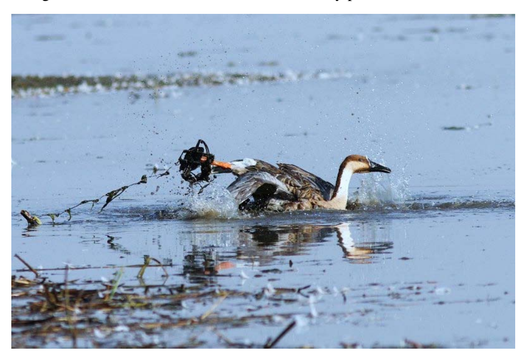
Fig. 5. A Swan Goose Anser cygnoides captured in Inner Mongolia, October 2011

During the investigations at the Altun Mountain Nature Reserve, we found that almost every family of herdsmen has a steel trap, which was used for capturing small mammals and large birds. We have found several steel traps around the lake. There was no doubt that they use these traps to capture waders and waterfowl, including cranes, swans, ducks and geese. A similar situation is common in every province of China.