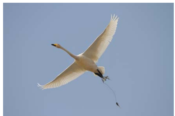
A swan with trap in Inner Mongolia, spring 2011

MOOIJ, J. H. (2005): Protection and use of waterbirds in the European Union. - Beiträge zur Jagd- und Wildforschung Bd. 30: 49-76.