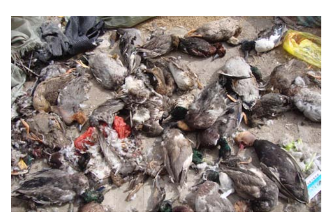
Fig. 6. Dead ducks as a result of poisoning in Aksu, March 2012

At stopover sites of migratory wildfowl, tens of thousands of birds were hunted by poachers in this way. In Liaoning, two hundred metres of poison bait was the longest witnessed in March 2012. Dozens of migratory birds were killed every day. Several species of geese were involved, such as Greylag Goose Anser anser , Bean Goose Anser fabalis , Swan Goose Anser cygnoides and White-fronted Goose Anser albifrons etc. Some other waterfowl species were also