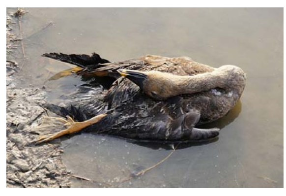
A Bean Goose killed by the poison Furadan (C<sub>12</sub>H<sub>15</sub>NO<sub>3</sub>) in Liaoning Province, March 2012