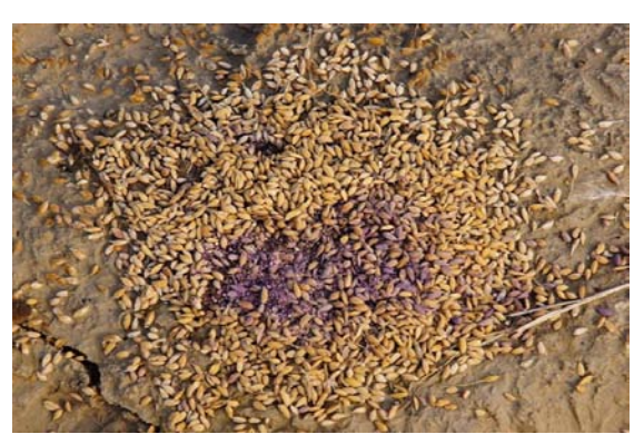
Wheat kernels with poison Furadan ( C_{12}H_{15}NO_3 ) in Liaoning Province