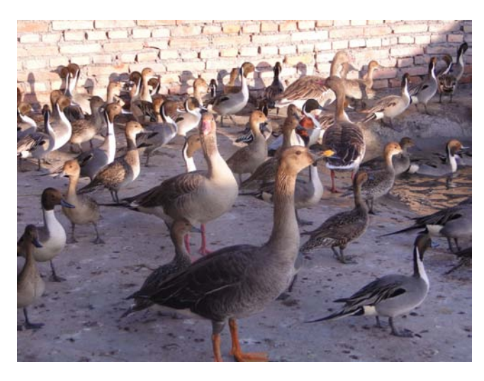
Fig. 7. About 600 wild geese and ducks captured by poison in Xinjiang, March 2012

Typically, a metal fishing lure with one or more hooks is usually deployed on the bottom of a lake or sea. These hooks are used mainly for fish, feeding in deep waters. Recently, they have been used for bird-catching as well. Fishing lures are spread out on the bottom of shallow waters, where waterfowl are active. Geese and ducks may step on the hooks and struggling further entangle hooks into their bodies.