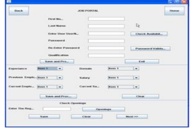
Fig. 4. Application Window

the faulty circuit behavior caused by defects. The generated patterns are used to test semiconductor devices after manufacture, and in some cases to assist with determining the cause of failure (failure analysis.[1]) the effectiveness of ATPG is measured by the amount of modeled defects, or fault models, that are detected and the number of generated patterns. These metrics generally indicate test quality (higher with more fault detections) and test application time (higher with more patterns). ATPG efficiency is another important consideration. It is influenced by the fault model under consideration, the type of circuit under test (full scan, synchronous sequential, or asynchronous sequential), the level of abstraction used to represent the circuit under test.