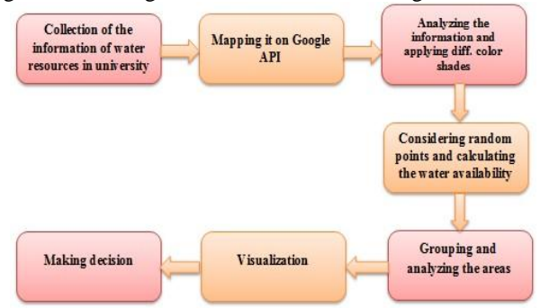
Figure 3.1 Process Flow diagram

Mathematical methods and numerical modelling are of great significance for groundwater management. Numerical models allow the analysis of the present conditions and the evolution of groundwater systems, as well as an estimation of the impact of factors such as temperature and salt dependent water density in the flow field. Furthermore, they can simulate and predict the spreading of solutes in groundwater as shown in Figure 3.1.