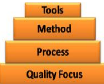
Figure 1.1: A Layered Technology

A layered technology helps for constant improvement in software growth process. For the software growth it has been divided into four layers and each layer correlates to each other. These layers are represented in the figure 1.1. It displays all the four layers upon which the software engineering relies so as to develop superior software. If all the layers are considered during build process, it tends to fulfill maximum user requirements and helps to move smoothly to whole the engineering process.