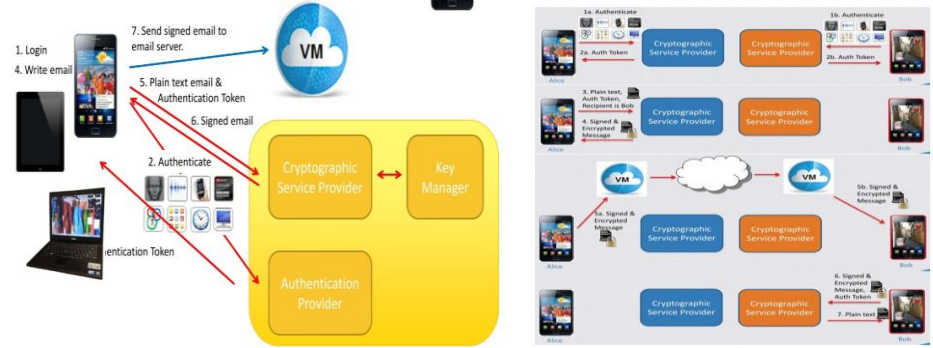
Figure 2 Illustration of How CAAS Works (Picture taken from Robinson [5],[7])

According to [7], CAAS services only require endpoint deviceauthentication to ensure that the device is able to perform access to CAAS. Therefore, a strict mechanism is needed to authenticate (strong authentication). This process can be done through a user authentication (passwords, voice, facial recognition, motion-based, one-time password) and the environmental authentication (Device ID, driver's license number, phone number, MAC Address, Location, Apps allowed to be on the phone, Time of day).