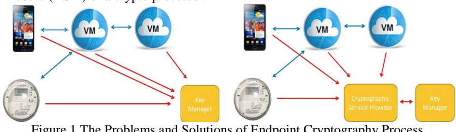
Figure 1 The Problems and Solutions of Endpoint Cryptography Process

General description of the process is presented in Figure 1. With the various advantages and disadvantages, CAAS is actually expected to be a solution for strong cryptographic service availability without having to use the help of the Hardware Security Module (HSM) or a crypto processor.