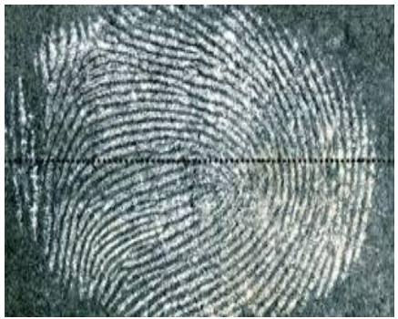
Fig.1: (a)Noisy Image

Image enhancement is a technique to improve not only visual perception of given images but also quality metrics of a distorted or noisy image. The primary aim of image enhancement is to change attributes of an image to make it more appropriate for a given task and a precise observer. One or more attributes of the image are modified during this process. Digital Image enhancement techniques provide a considerable amount of choices to improve the visual quality of images. Proper choice of such techniques is greatly inclined by the imaging modality, task at hand and viewing conditions [5].A common example of enhancement is shown in Fig.1. In fig 1 when we amplify the contrast of an image and filter it to remove the noise "it looks enhanced". To improve the quality of the degraded images we use various enhancement algorithms [2].