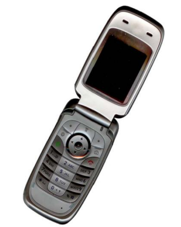
Fig. 3 Example of an image with acceptable resolution