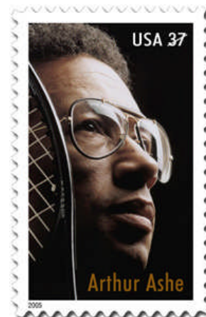
Arthur Ashe 8/27/2005