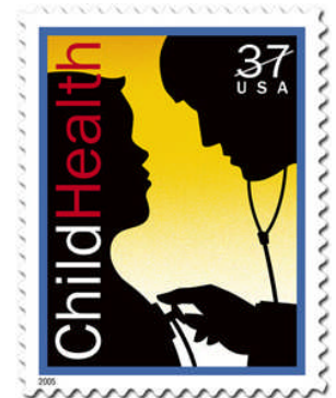
Child Care 9/7/2005