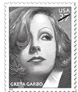
Greta Garbo 9/23/2005