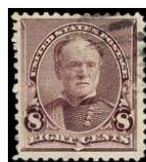
Eight Cent Lilac Sherman

Unwatermarked - Perforated 12 - Flat Plate - Printed By the American Bank Note Company