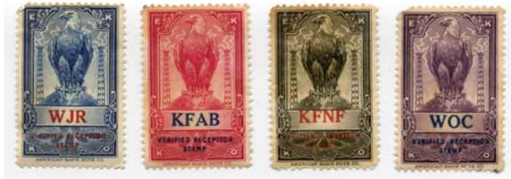
Ekko Stamps come in a variety of design and call letter colors.

Other countries jumped on the EKKO promotional idea and included Canada, Mexico, and Cuba. There were over 700 radio stations that participated in the use of verified reception stamps. If you are looking for a new collecting area, perhaps the Ekko stamps are right for you. Take it from me, you'll get used to being rated on the "You bought what?" meter.