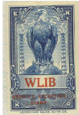
WLIB Elgin, Illinois Ekko Stamp.

My latest find is an Ekko stamp, also known as a "Verified Reception Stamp". This is a Cinderella stamp and it comes with a big piece of radio history. Verified reception stamps were produced beginning in 1924, by the American Bank Note Company and remained popular until 1930. Other companies soon began to produce a likeness to the EKKO stamp, but it was the EKKO Company in Chicago, Illinois that began the craze. Ekko came up with the gimmick of selling broadcast radio stations on the idea of giving verified reception stamps to their listeners. This promotion would enable the station to determine both the size and location of its listening audience.