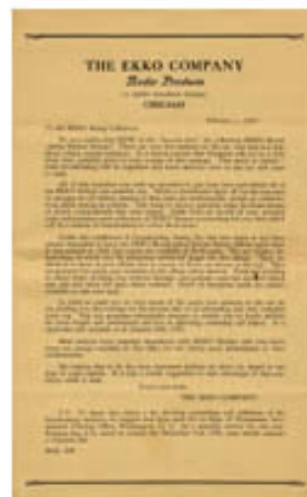
Pages from the 1924 Ekko Album, which was 70 pages in size.