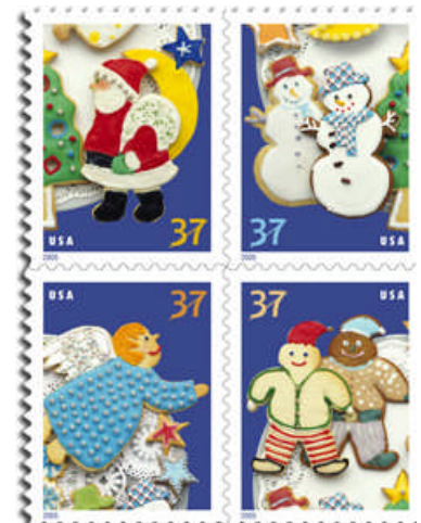
Holiday Cookies 10/20/2005