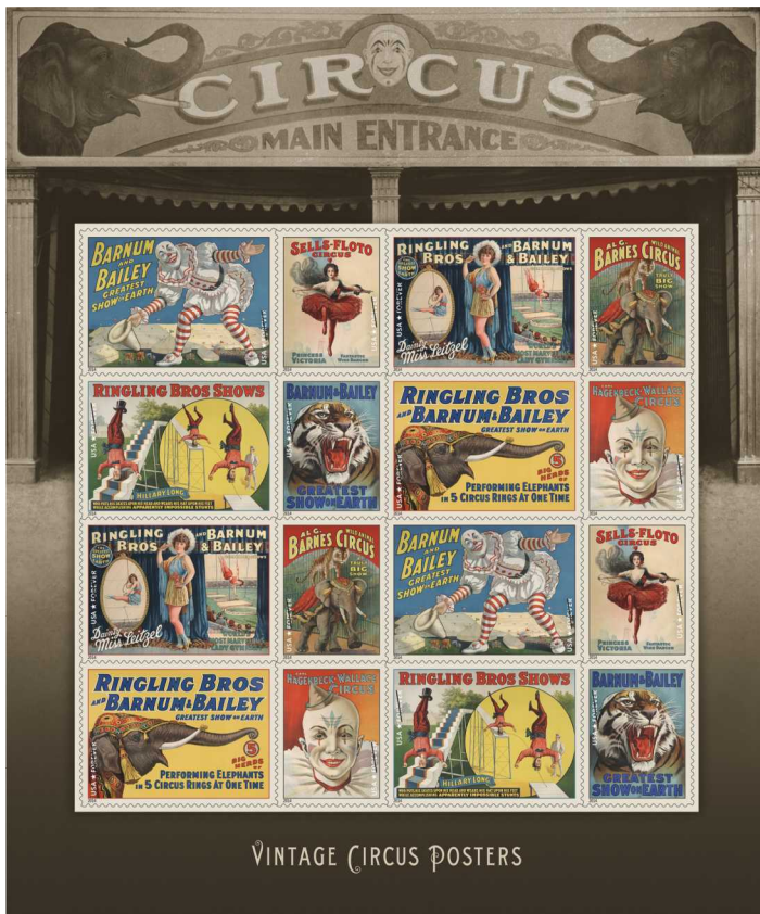
VINTAGE CIRCUS POSTERS

Here are some of the new stamp designs that will be issued by the USPS in 2014. Pictures and data in this article are from www.usps.com and are © 2014 USPS.