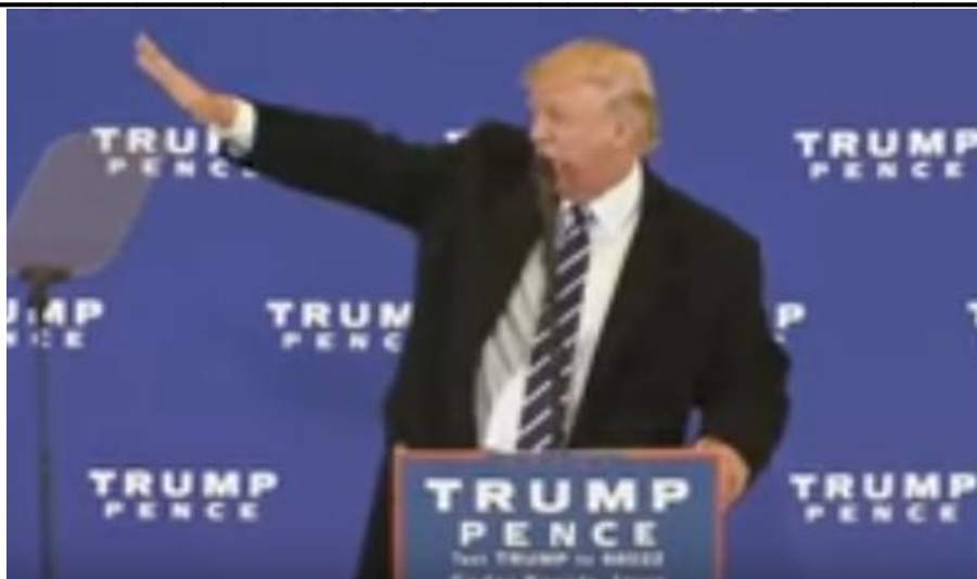
He made it!

http://www.i24news.tv/en/news/international/europe/129469-161106-germany-probes-zuckerberg-for-ignoring-holocaust-denial-posts