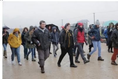
North East school children visit Auschwitz camps with the Holocaust Educational Trust

But the trip also emphasises that it isn't some distant historical oddity, a piece of the past we can dismiss because it could never happen again.