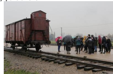
North East school children visit Auschwitz camps with the Holocaust Educational Trust