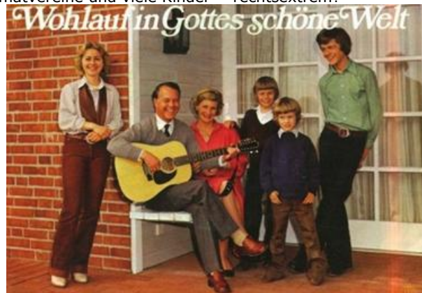
Mehr als ein Kind ist schon extrem völkisch

Heimatvereine und viele Kinder = rechtsextrem?