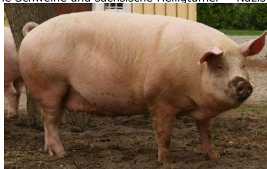
Das "Meißner Landschwein" - ein extrem deutsches Schwein

Deutsche Schweine und sächsische Heiligtümer = Nazis