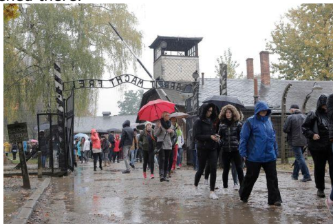
North East school children visit Auschwitz camps with the Holocaust Educational Trust

These men were desperate for the world to know what happened at Auschwitz, so much so that, as well as burying letters and diaries, they littered the ground with human teeth harvested from the bodies they were made to dispose of, so that anyone who came across the site would know something terrible had happened there.