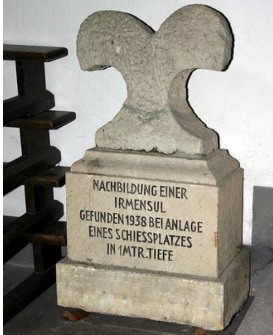
Da steht nichts von: Das ist Böse!!!

Ein weiteres Zeichen für superextremes ganz weit rechtes Gedankengut sind z. B. Nachbildungen einer Irmisul. Wenn Ihr so etwas auf einem Grundstück seht, dann nehmt schnellstmöglich Eure Beine in die Hand und rennt sofort nach links, denn dort leben hundertzwanzigprozentig extrem Rechte.