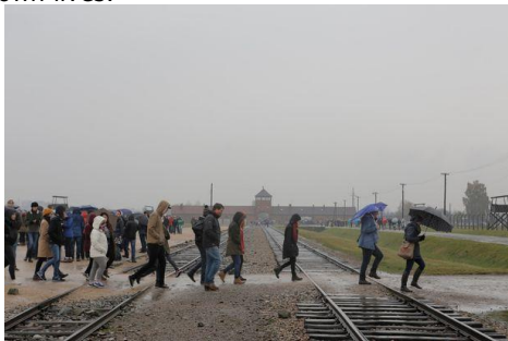
North East school children visit Auschwitz camps with the Holocaust Educational Trust

"Coming here helps you to see that they were all real people, with their own lives."