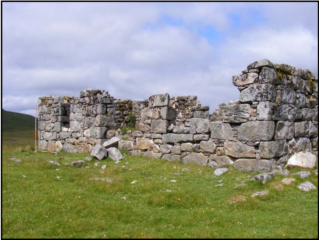
Top: View of house (site 1) facing NW – scales 2m. Bottom: View of sheepfold (site 2) facing NE.