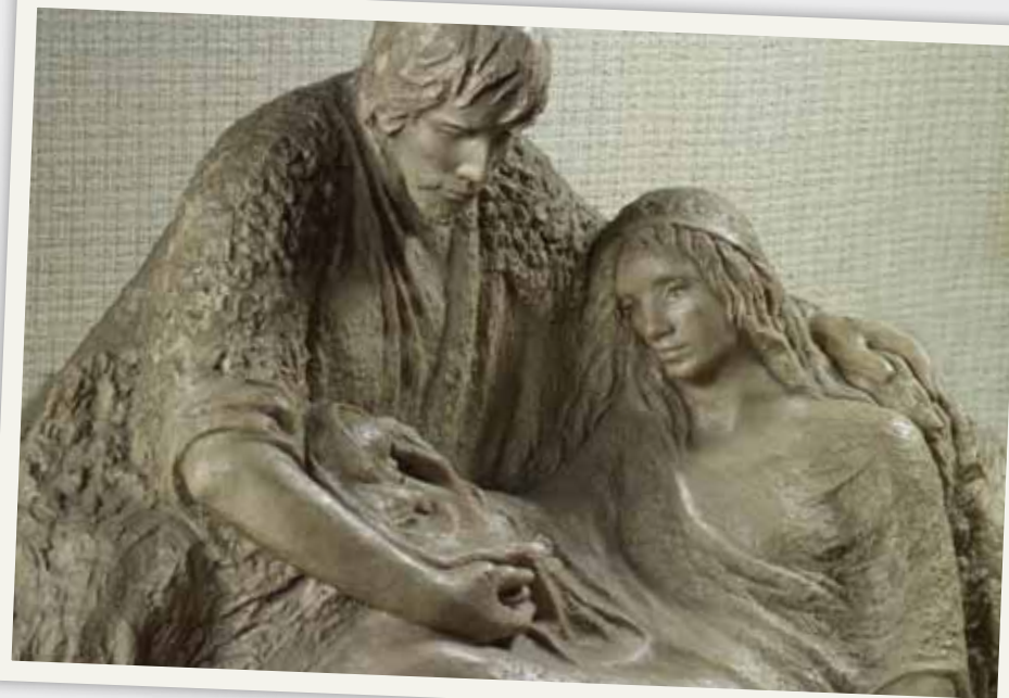
'Holy Night' sculpture by Josefina de Vasconcellos