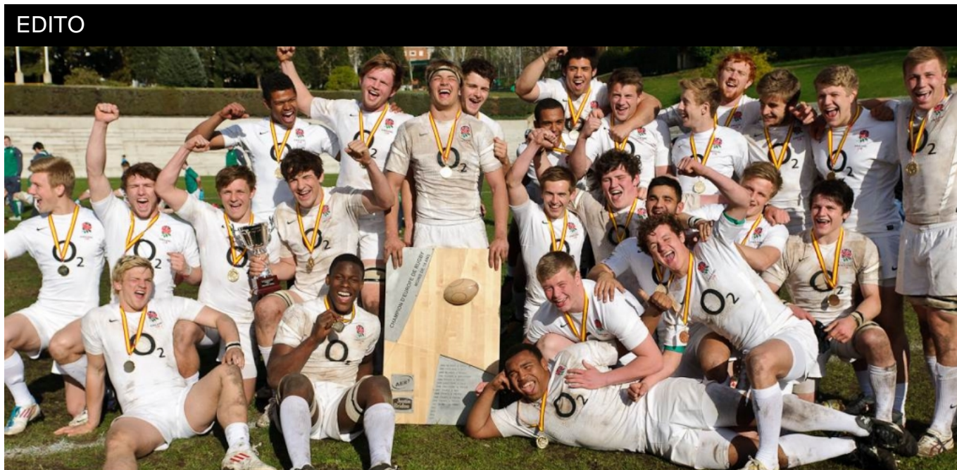
120407 U18 Elite IR EN Game photo 7