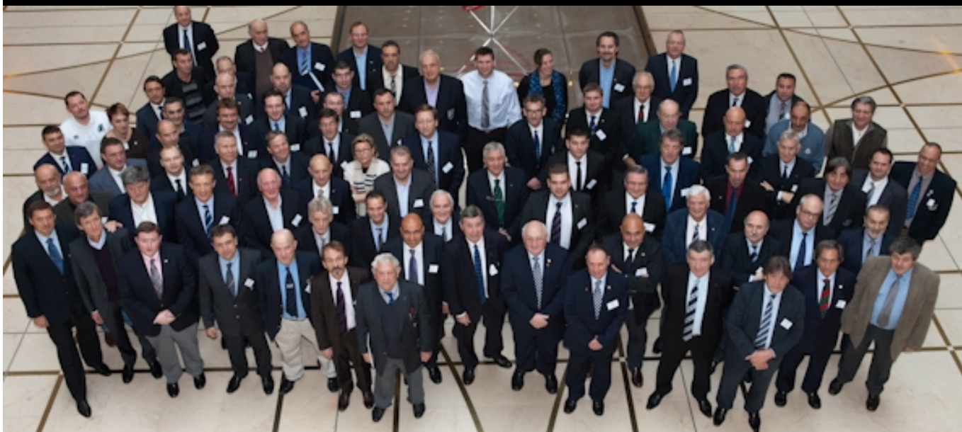
121130 AGM FIRA-AER Paris