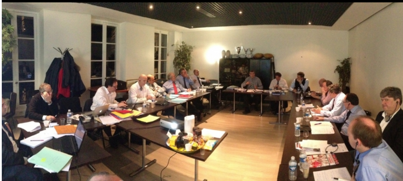
130130 FIRA-AER ExCo 1-13