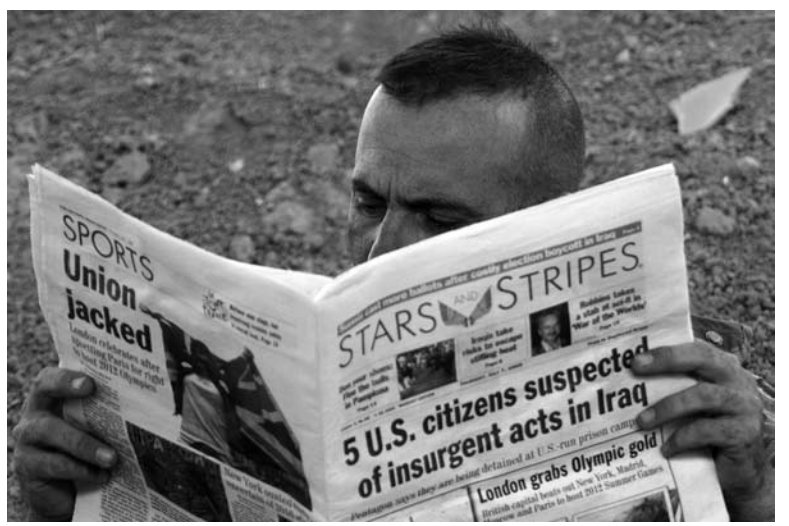
Traditional media delivery.

Analyst Ben Venske notes jihadi videos are another terrorist favorite. They are used for several specific purposes instead of the "organized bazaar" represented by YouTube. These are: as instructional material, to make