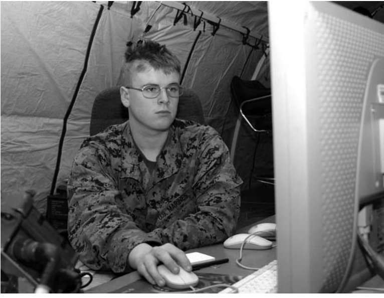
Young and blog-savvy: the face of the CYOP generation.

as well. For example, a subscriber recently used Google Earth to document military actions on both sides of the Israeli-Lebanese border. The subscriber's maps provided an instantaneous photo montage of potential military strategies, acting as an intelligence source for groups without satellite capabilities. As one description of the site noted, it contained "details on the action which occurred at the location and the casualties or damage resulting, and allows you to view the