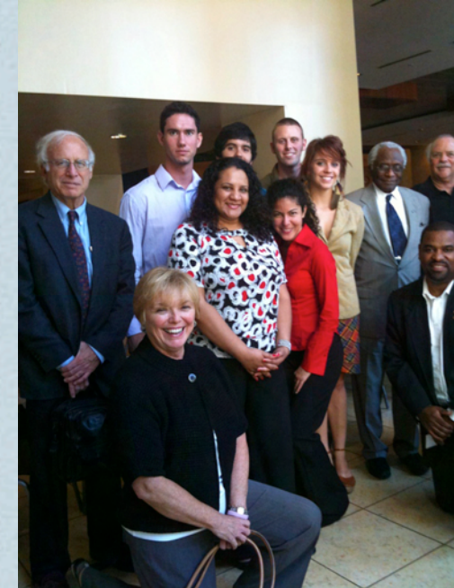
Meeting with U of Tampa Students