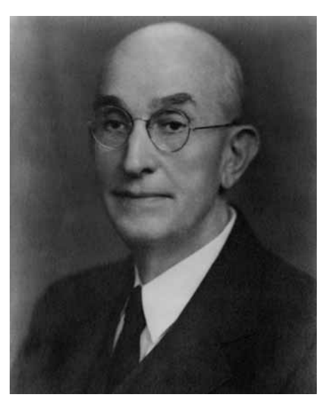
Senator Carl Hayden, chairman of the Senate Appropriations Committee.

Although its FY 1956 appropriation remained relatively flat, for the first time it had 20 percent of the Agency's funding going to "science," reflecting the new responsibilities the administration had given it, among them the development and construction of the U-2 reconnaissance aircraft, as well as the growth of its in-house technical capabilities (see chapter 8).30 Although few members of Congress were aware of the Agency's new responsibilities in this area, the leaders of the CIA subcommittees and their respec-