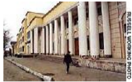
The Soviet army officers' house in Khabarovsk, Soviet Union

The trial, rammed through Stalinist courts in five days, is the forgotten war-crimes prosecution of the 20th century. It followed the 10-month-long Nuremberg trials and the two-year-long Far Eastern War Crimes Tribunal in Tokyo. But the Khabarovsk trial casts light on a wound that still festers in Asian international relations. Anger at Japan runs deep in both Korea, China, the Philippines and other nations occupied in World War II to whom Japan has never paid reparations or issued a satisfactory apology. And even as war-crimes victims and their descendants are suing the Japanese government for compensation, the nation's Education Ministry approved a textbook this past April glossing over the Imperial Japanese Army's wartime culpability.