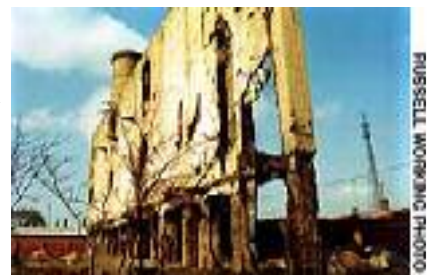
One of the few remaining structures of Unit 731's secret facility in Harbin, China: the concrete wall of a boiler house

The base was publicly known as the Epidemic Prevention and Water Supply Unit, and its true mission was top secret. But the Soviet Consulate in Harbin quickly realized that something strange was going on, said Permyakov, who worked in the consulate during the war. Suddenly work crews built and paved a road to Pingfan, and it was crowded with the cars of officers. Black prison vans known as "voronki," or ravens, began racing through Harbin. As they headed out of town, pedestrians could hear prisoners pounding and shouting for help. Unknown to the Japanese, the consulate lofted a small, clear-plastic hydrogen balloon carrying a tiny camera that secretly photographed the entire complex, Permyakov said.