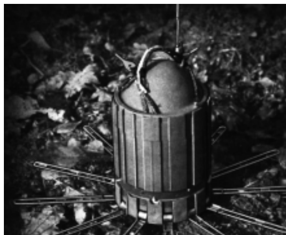
AT-2 (Germany) Anti tank mine with anti handling device. Prohibited by the Italian Law No. 374, 1997, rules for the ban of antipersonnel mines