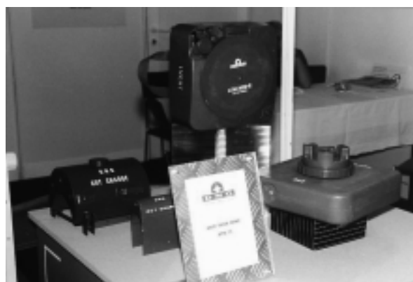
ATM 2000 E (Austria) Anti-tank mine equipped with a magnetic fuze and an anti handling device

For approximately 3 years the industry has been describing the "Claymore" types of mine as anti-vehicle or directional fragmentation mines, whereas they are in fact anti-personnel mines. The industry attempted to keep these mines outside the ban simply by pointing out that they are now no longer marketed with trip wires and are supplied without pull-type fuzes. The attempt was successful, because the Ottawa Convention does not ban this type of mine. Yet it is a simple matter to retrofit these mines with trip wires or pull-type fuzes. Austrian manufacturers of these mines also go no further than instructing the purchaser: "Don't use with trip wire".