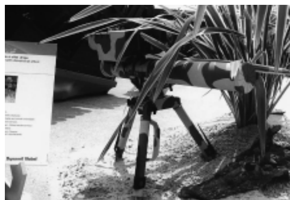
ARGES (Germany, France, UK) Sensor fuze off route mine