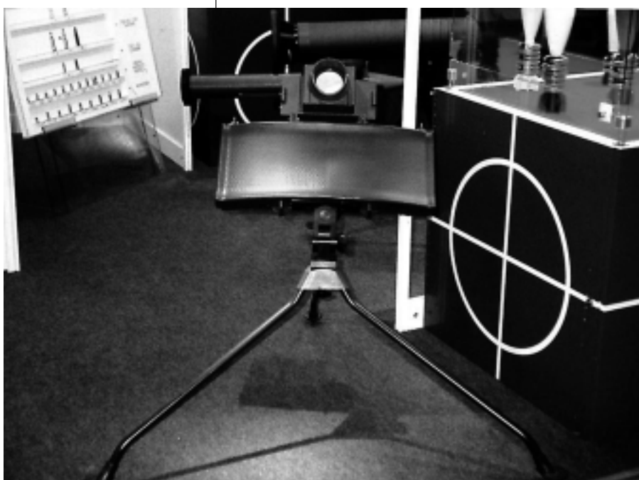
Helicopter Mine (Austria)

Turkey (use of mines against the Kurds, mining of the “buffer zone” in Cyprus) and Greece (mining of the border with Turkey, mining of the “buffer zone” in Cyprus) take a similar stance.