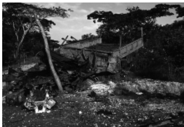
Civilian truck hit by an AT mine in Angola