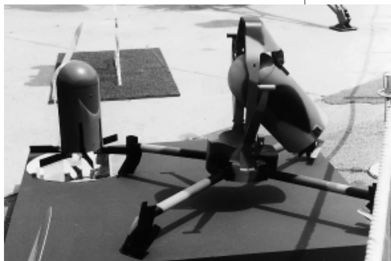
Mazac (France) Sensor fuzed area defence mine