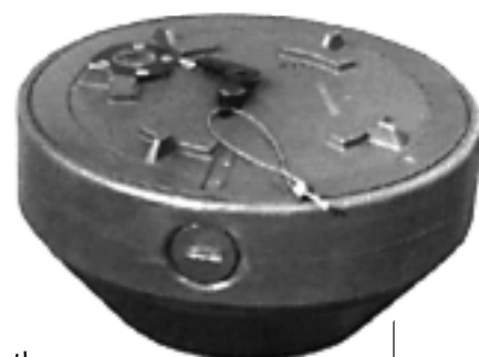
DM-31 (Germany) Anti tank mine equipped with a magnetic fuze and an anti handling device

All CCW and Ottawa member states should be asked to report all existing AT/AV mine stockpiles to the UN General Secretary. Ottawa Member States should provide this information within their article 7 reports.