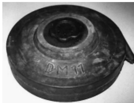
DM-11 (Germany) Anti tank mine, used in Somalia. The mine is fuze with the DM 46 pressure type fuze with a Belleville spring and the DM 21 detonator. The DM-11 has two secondary fuze wells, one in the side of the mine and one in the bottom. The mine can be equipped with an anti handling device.

When AT/AV mines are fitted with an anti-handling (anti-lift, anti-disturbance) device, the potential risk to civilians is even higher (see below). Merely approaching such mines, standing close to them or touching them gently can cause them to explode, which means certain death for the victim. Anti-handling devices are, after all, designed to make the separate deployment of AP mines superfluous, and prevent an AT/AV mine from being cleared. Without a doubt, this means that AT/AV mines possess characteristics of AP mines, by virtue of