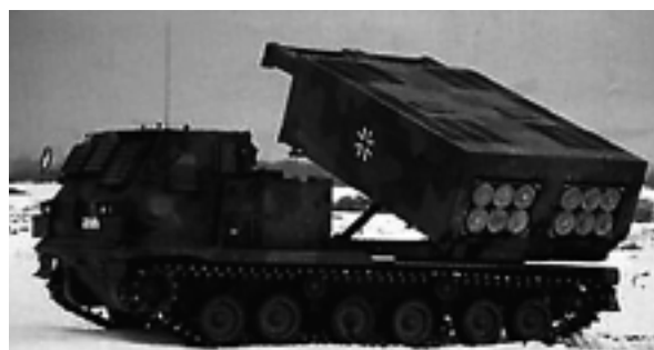
Rocket Launcher MARS/MLRS (Germany) Scatters AT-2 mines