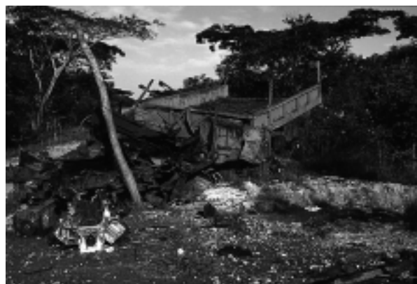
Civilian truck hit by an AT mine in Angola