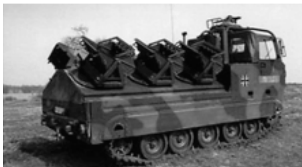
Minelauncher Skorpion (Germany) Scatters AT-2 mines

Besides anti-handling devices these technical discussions must include sensors, fuzes and explosives in order to prevent the deadly threat for civilians, which presently exists with many AT/AV mines in use. The Ottawa Convention must address the severe antipersonnel effects of AT/AV mines if it does not want to become obsolete. However the German Initiative questions if technical modifications on AT/AV mines sufficiently prevent civilian casualties. When scattering mines there would for instance be a high risk of malfunction, quite apart from the issue of whether the “adjustment” itself would function reliably or not. At any rate, this method would not prevent “normal” activation of the mine, e.g. by a school bus filled with passengers. In the light of the current warfare praxis and the landmine technology developments the German Initiative calls for a ban on all types of mines.