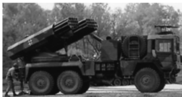
Rocket Launcher LARS (Germany) Scatters AT-2 mines

*United States Department of State (1998): Hidden Killers