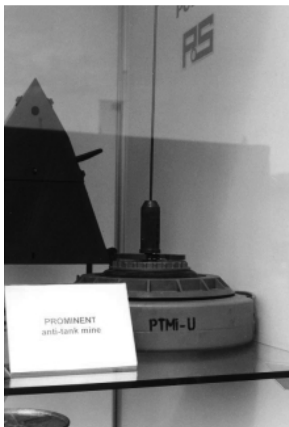
PT-Mi-U „Prominent“ (Czech Republic) Anti tank mine with tilt rod fuze