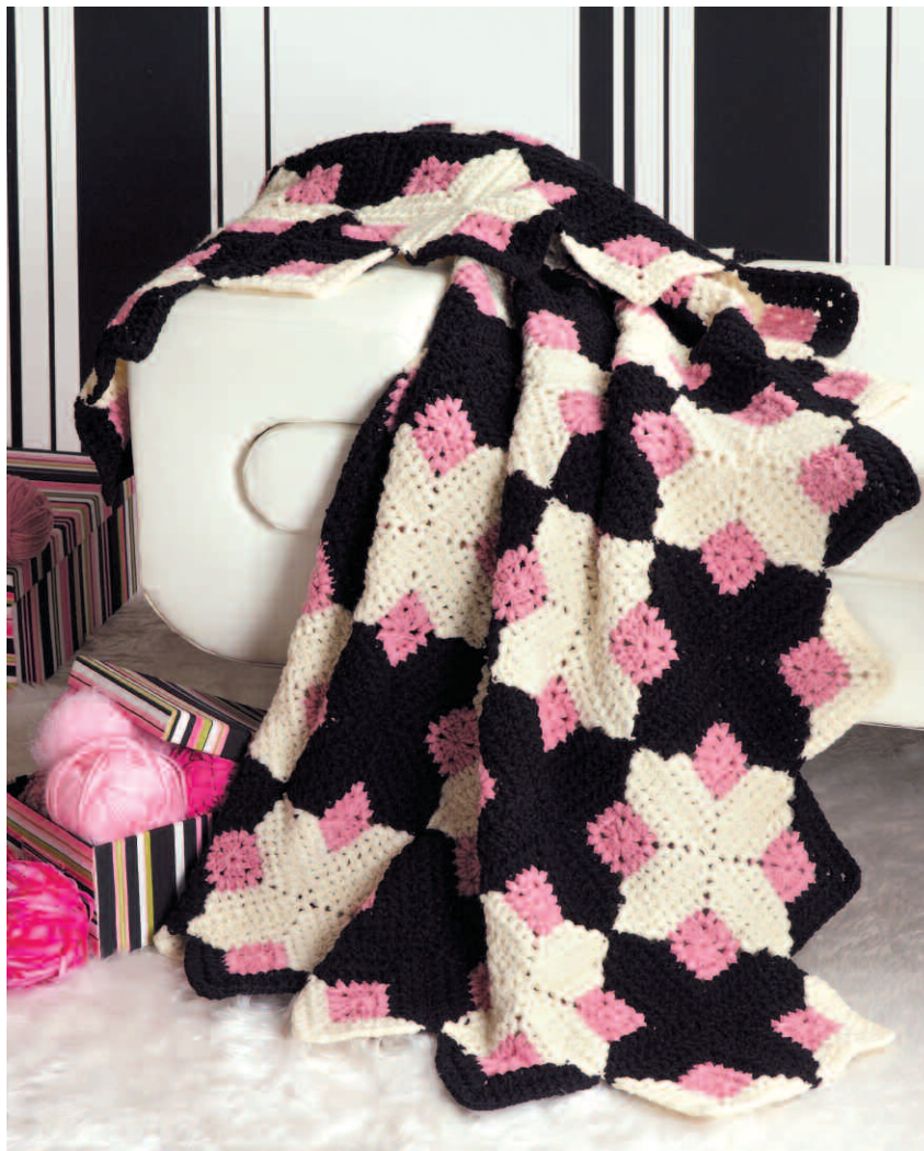
crochet retro afghan