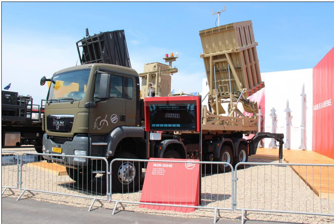
Figure 5. Iron Dome Launcher

In September 2016, an Iron Dome battery stationed in the Israeli-controlled Golan Heights intercepted two stray projectiles fired from Syrian territory, marking the first instance when Iron Dome was used to defend Israeli territory against threats emanating from the Syria conflict.