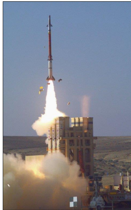
Figure 6. David's Sling launches Stunner Interceptor