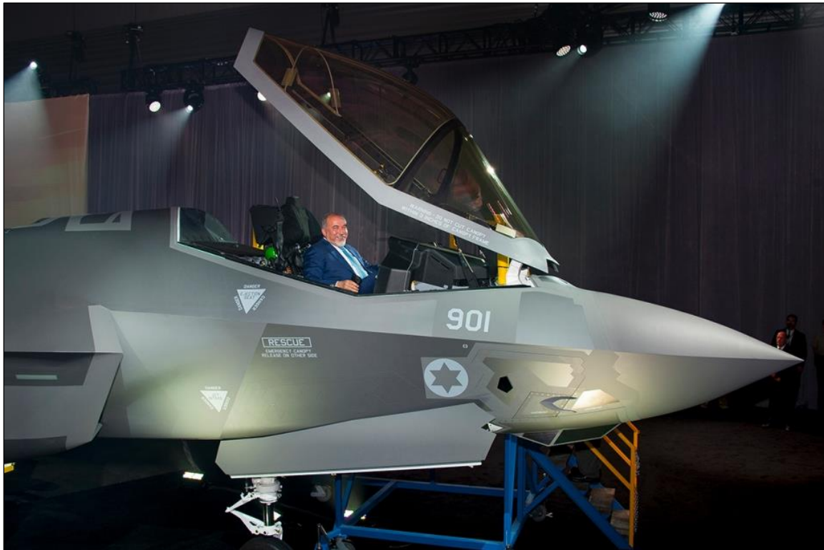
Figure 4. The Israeli Variant of the F-35A Lightning II Known as the “Adir” (translated from Hebrew as ‘Mighty One’)