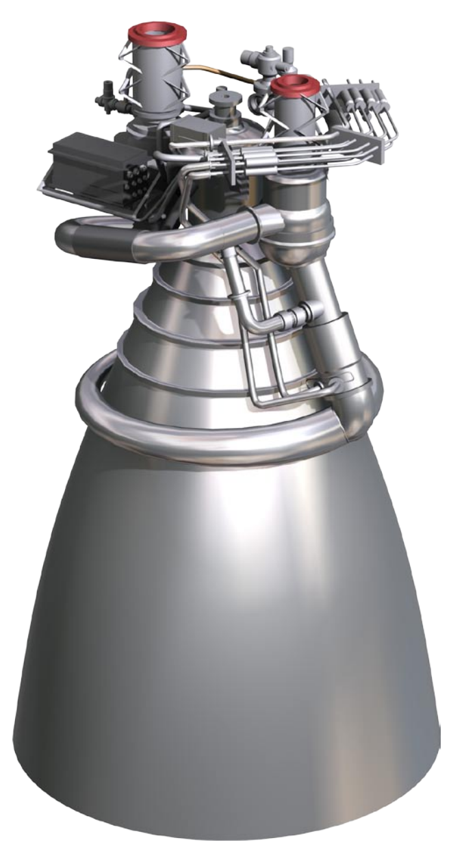
Concept image of the J-2X engine.

Atop the central booster element is an interstage cylinder, which includes booster separation motors. It connects the core stage to the Ares V Earth departure stage, which is propelled by a J-2X main engine. The J-2X, also powered by liquid oxygen and liquid hydrogen, is an evolved variation of two historic predecessors: the powerful J-2 upper-stage engine