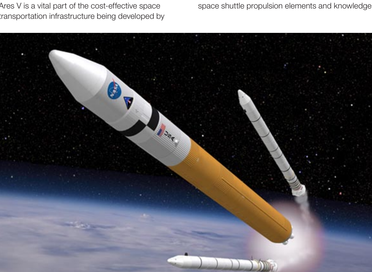
Concept image of Ares V in Earth orbit.

The Ares V effort includes multiple hardware and propulsion element teams at NASA centers and contractor organizations around the nation, and is led by the Ares Projects Office at NASA's Marshall Space Flight Center in Huntsville, Ala. These teams rely on nearly a half century of NASA spaceflight experience and aerospace technology advances. Together, they are developing new vehicle hardware and flight systems and maturing technologies evolved from powerful, proven Saturn rocket and space shuttle propulsion elements and knowledge.