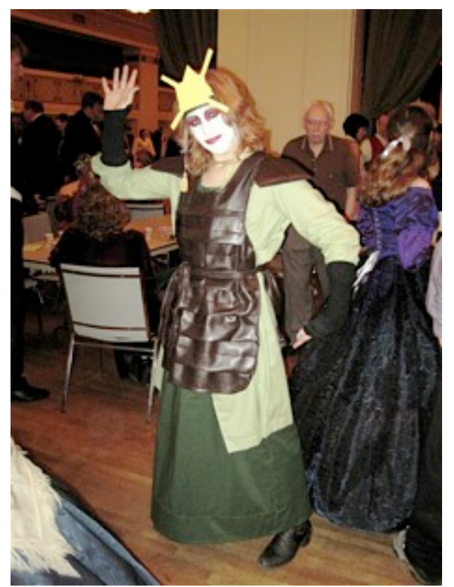
Suki from Avatar