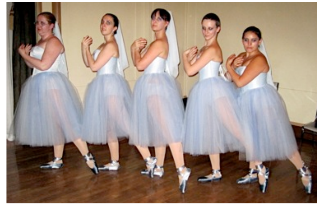
Degas Blue Dancers

For more information, visit: www.gaskellball.com.