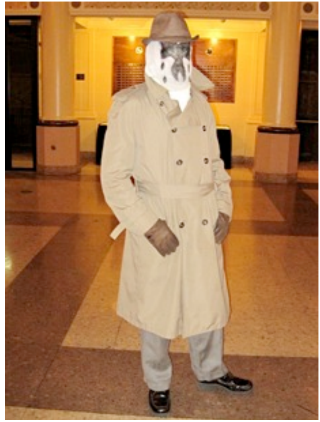
Rorschach from Watchmen