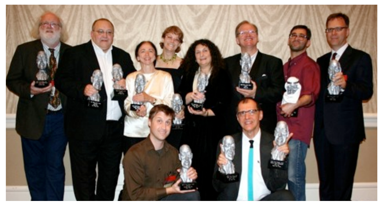
World Fantasy Award Winners

The Clarionites were toward the back of the room and I went over to them after the awards ceremony was over. I hung out with them at the