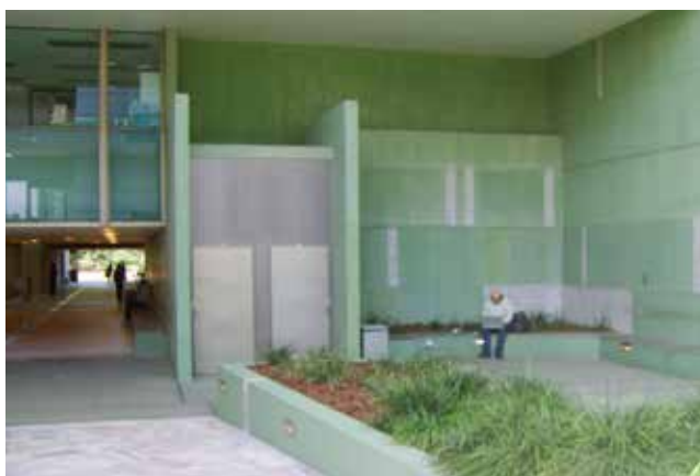
ABOVE IMAGE: STATE LIBRARY OF QLD EXIT WITH WIFI ACCESS

Public libraries are redefining their role in the face of a rapidly changing digital culture. Expanded digital networks and Web 2.0 platforms have created new opportunities for greater citizen participation in civic and cultural life, articulated variously as participatory culture (Jenkins 2009), creative consumption (Hartley 2007) and the rise of the 'user' (Wright 2013). However, it is evident that desired dividends such as greater social engagement, enhanced cultural awareness and increased civic and political participation do not flow automatically from the mere technical connection to the network. The gap between technological capacity and social and political outcomes is crucially mediated by institutional strategies, approaches and practices.