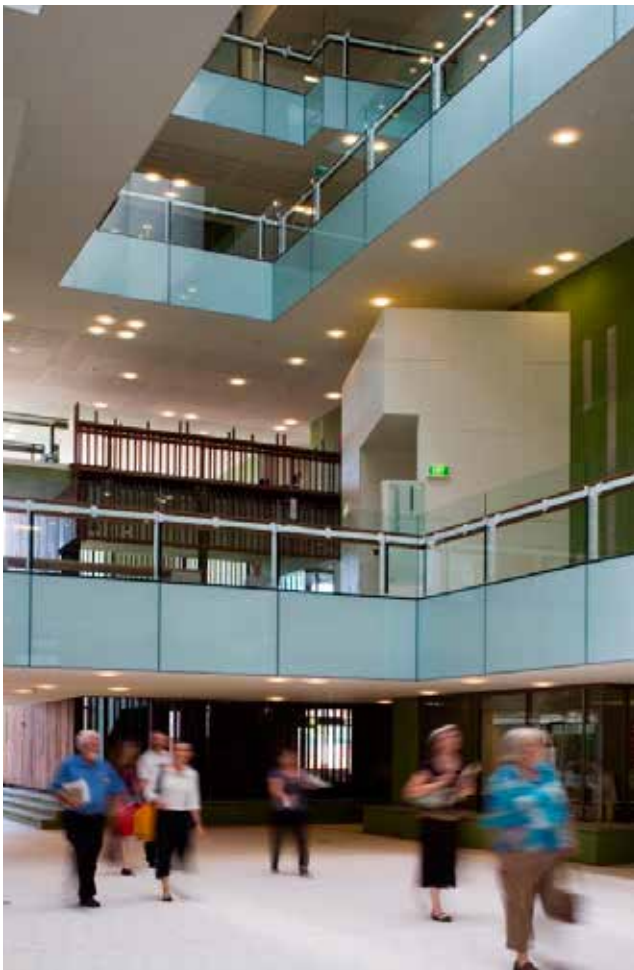
ABOVE IMAGE: STATE LIBRARY OF QUEENSLAND KNOWLEDGE WALK. IMAGE COURTESY OF STATE LIBRARY OF QUEENSLAND. PHOTO BY JON LINKINS.

During the 1990s, the dominant understanding of 'cyberspace' was that the virtual world formed a kind of parallel universe, disconnected from and operating under different laws to traditional social space. This understanding of the relation between digital and physical space as a dichotomy is continued by those such as Pomerantz and Marchionini (2007) who treat the digital and physical library as embodying different modes of being in place. Their forensic theoretical study argues that as digital technologies suffuse the library space and assume its core functions, physical libraries will adjust their role, by offering specialized materials not available online, as well as a space for social activity and collaboration (Pomerantz and Marchionini 2007, 527). 8