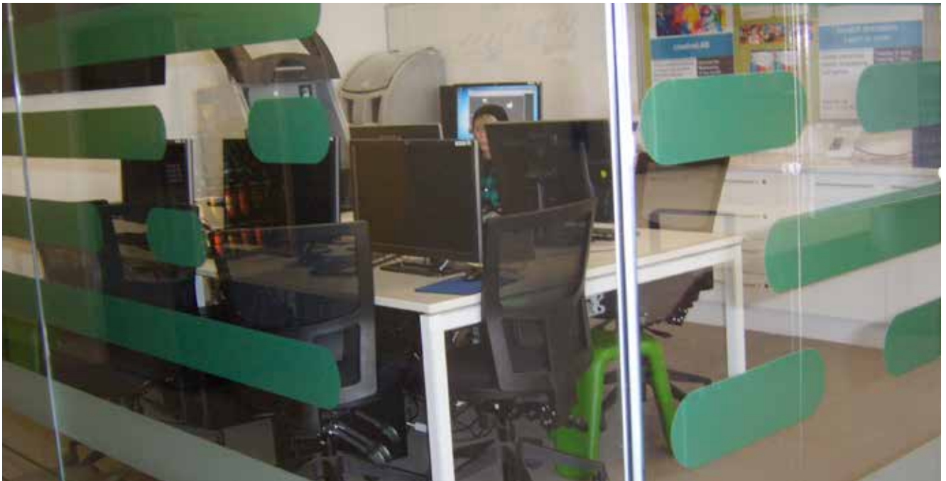
IMAGES FROM L-R: HELENSVALE LIBRARY FOYER; HELENSVALE LIBRARY MEDIA LAB

However, even libraries with better space resources are increasingly faced with the need to make choices: expanding spaces for 'non traditional' library uses often means bookshelves and collections are being reduced, or resituated in less prominent locations. Hyperdome Library in Logan has cleared an entire floor of the library of books and turned it into the TLC Lounge. 10 Here, people can use the 3D printer, make music or browse ebooks on large, desk-mounted screens.