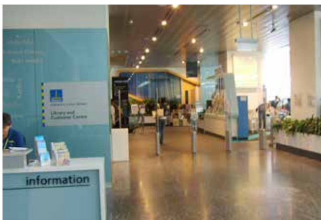
ABOVE IMAGE: BRISBANE CITY LIBRARY ENTRANCE