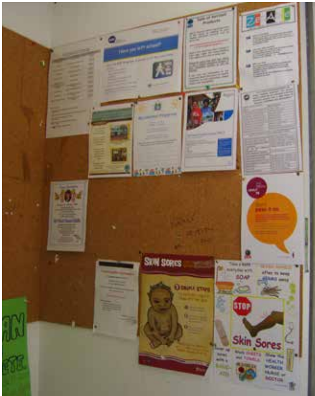
ABOVE IMAGE: IBIS LIBRARY, PUBLIC NOTICE BOARD

The Broadband Availability and Quality Report identified a significant proportion of premises unable to access any type of fixed line broadband service. Regional and remote areas are the most poorly serviced, with fewer digital services, and slower and less dependable connectivity (DOC 2014: 4).