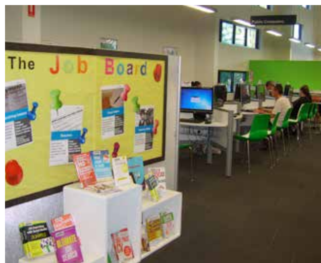
BELOW IMAGE: UPPER COOMERA LIBRARY TERMINALS

Some of our respondents were surprised that the demand for public Internet terminals has not diminished. 'We've actually surprisingly found that there's possibly more demand... I had my reservations about the number of public PCs, because we'd put 26 or 27 public PCs in. And I thought, 'Well, I don't actually know if we're of that world any more where we need banks and banks of PCs'. But they get filled pretty quickly – quite a lot.'