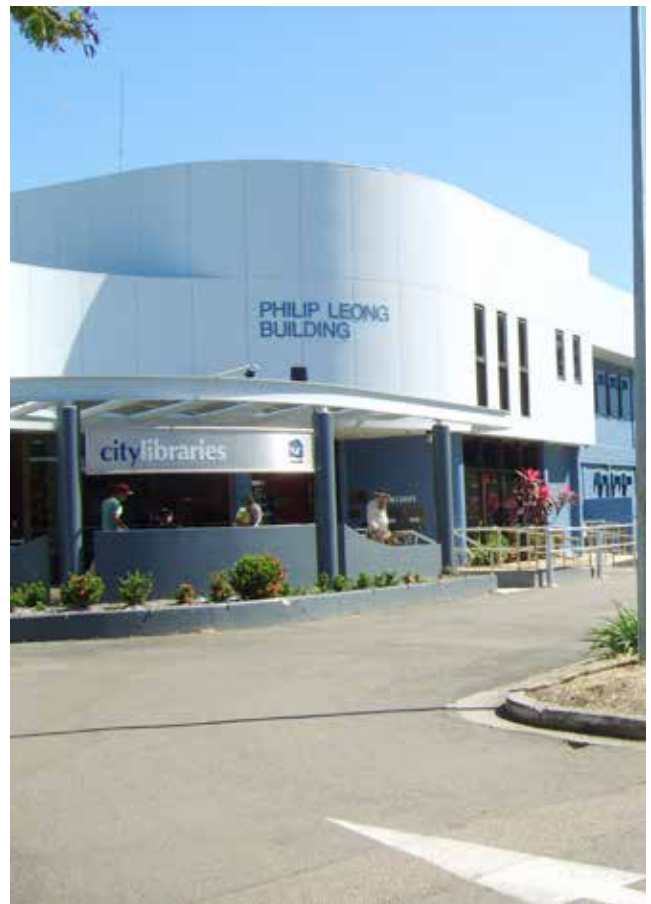
IMAGES L-R: AITKENVALE LIBRARY ENTRANCE; AITKENVALE LIBRARY, STREET VIEW

The popularity of all-night Wi-Fi is especially relevant to the growing rates of homelessness: 'It's largely hidden. It's not like you'd see on the streets of major capital cities, but there is a homeless population. It seems uncommon if they don't have a smart phone, a tablet or a laptop. They do.'