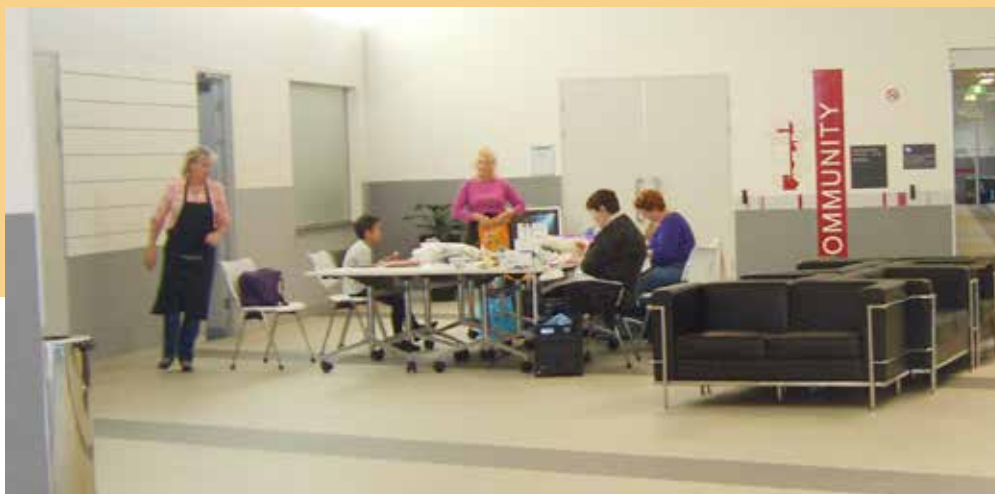
ABOVE IMAGE: UPPER COOMERA LIBRARY FOYER

In addition, the affordability of digital access in Australia is relatively low: Australia ranks 49th in world rankings for digital affordability (Digital Australia 2014).