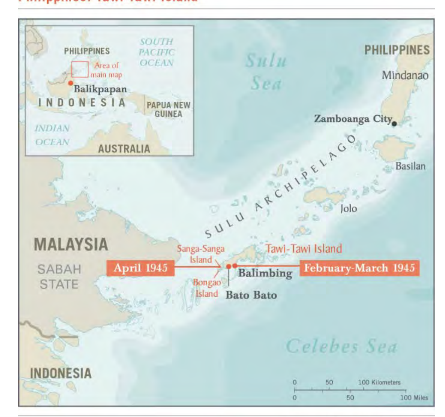
Philippines: Tawi-Tawi Island

After arriving on Tawi Tawi, an advanced party spent the day pouring over maps to find a suitable collection site. After a reconnaissance the following day, the party selected Balimbing Hill, in Balimbing (now known as Panglima Sugala) as a suitably elevated location for collection coverage of known enemy positions