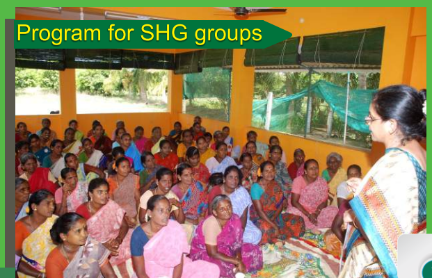
Program for SHG groups