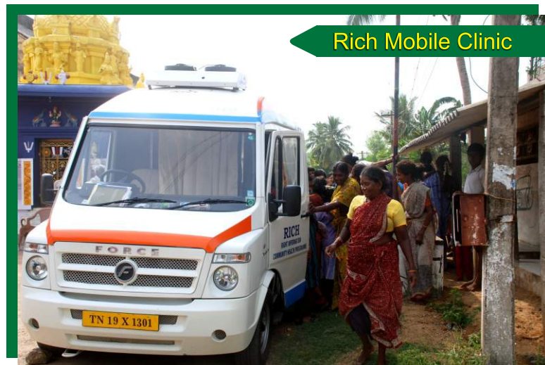
Rich Mobile Clinic