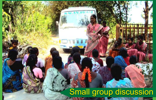
Small group discussion

During the village health camps, surveys on the RICH services are conducted from five percent of the beneficiaries. In the last audit, over 75% rated the program highly by giving scores between 7 to 10. The RICH program is supported by Share and Care Foundation, USA, LMS India and other local donors.