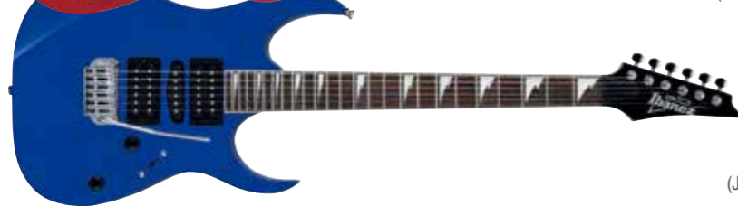
JB (Jewel Blue)