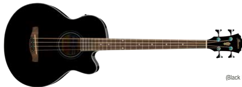
BK (Black High Gloss)