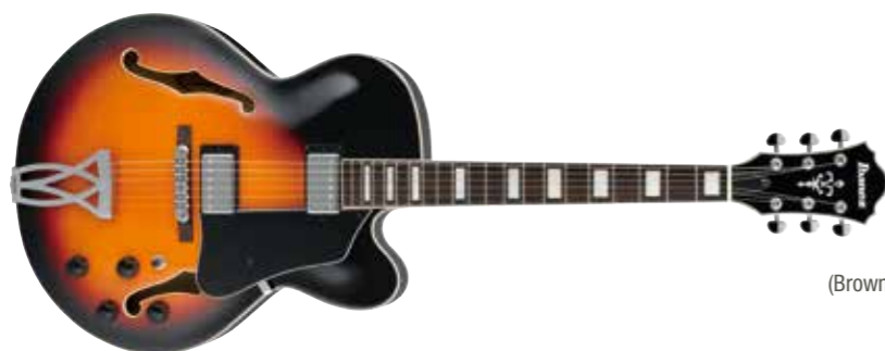
BS (Brown Sunburst)