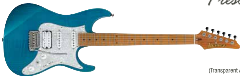
TAB (Transparent Aqua Blue)