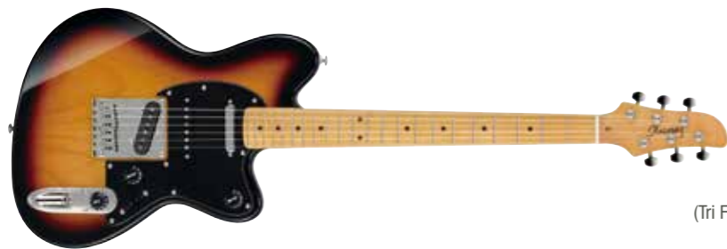
TFB (Tri Fade Burst)