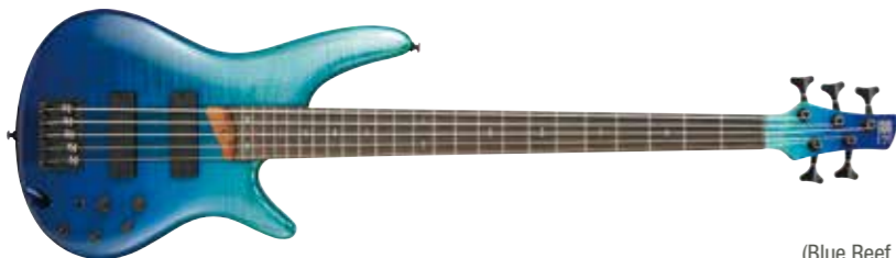
BRG (Blue Reef Gradation)