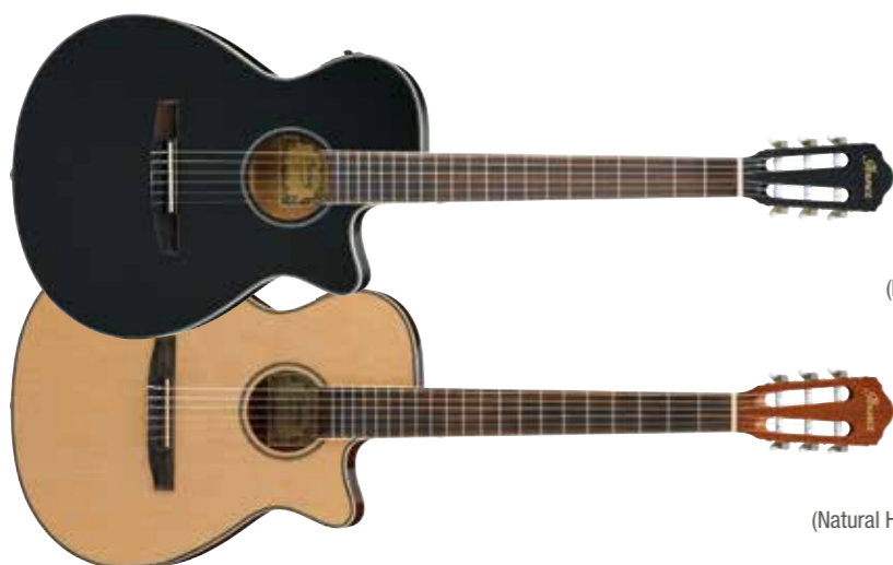
BKF (Black Flat)