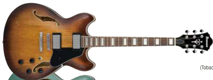
TBC (Tobacco Brown)