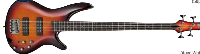
AWB (Aged Whiskey Burst)