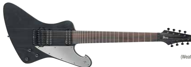
WK (Weathered Black)