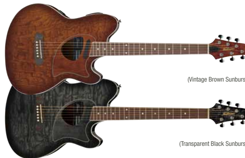
VBS (Vintage Brown Sunburst High Gloss)