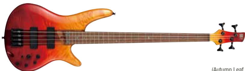
ALG (Autumn Leaf Gradation)