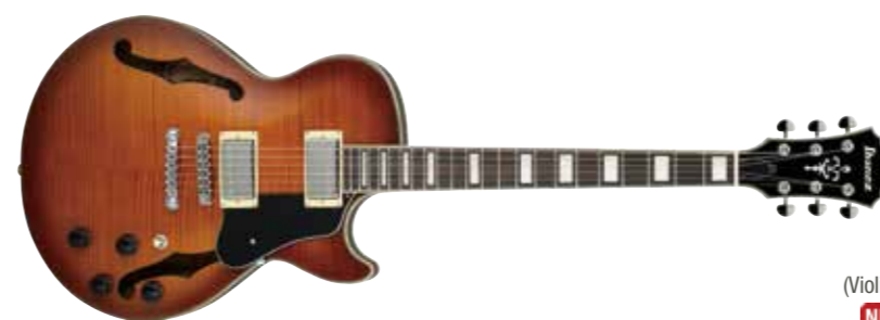
VLS (Violin Sunburst) NEW FINISH