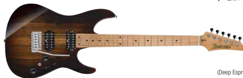
DET (Deep Espresso Burst)