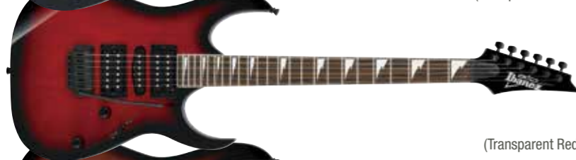
TRS (Transparent Red Sunburst)