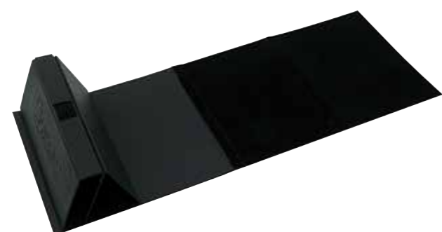
POWERPAD® Guitar Work Station