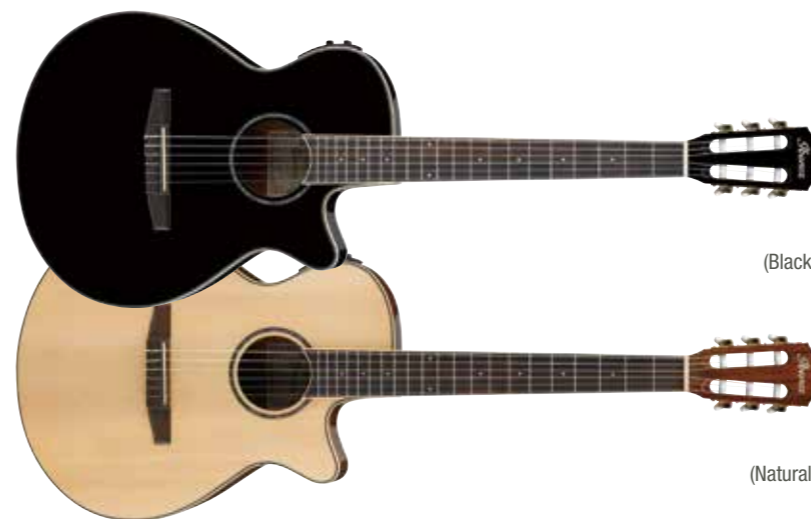
BK (Black High Gloss)