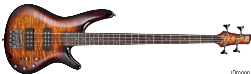
DEB (Dragon Eye Burst)