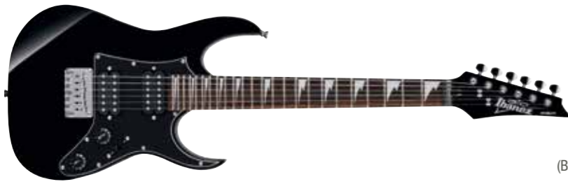
BKN (Black Night)