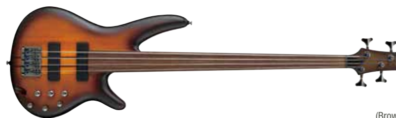
BBF (Brown Burst Flat)