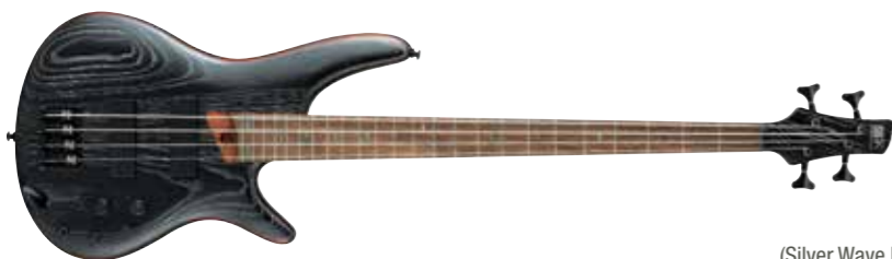
SKF (Silver Wave Black Flat)