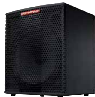
Bass Combo Amplifier P3115