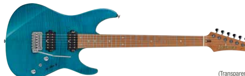
TAB (Transparent Aqua Blue)