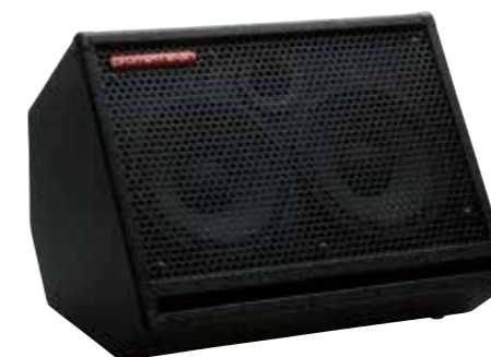
Speaker Cabinet P210KC