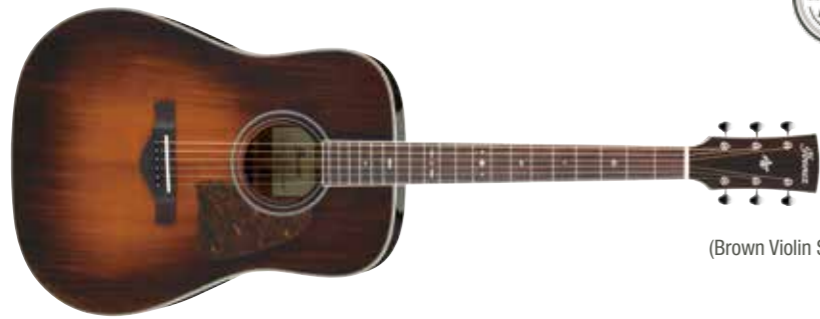
BVS (Brown Violin Sunburst)