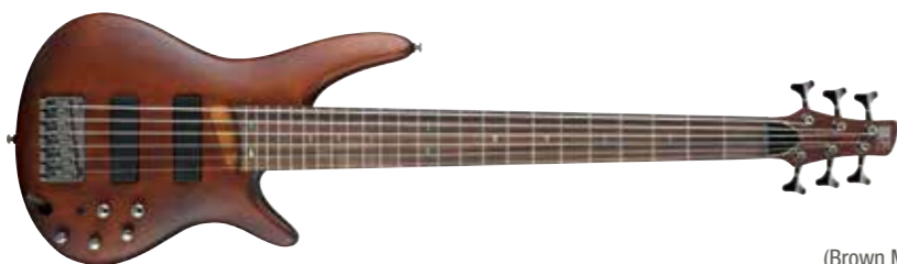
BM (Brown Mahogany)