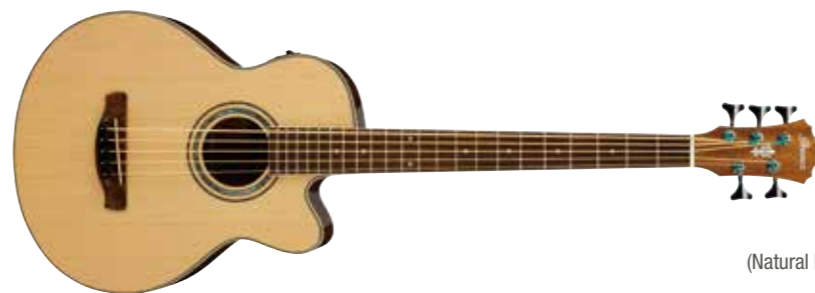
NT (Natural High Gloss)