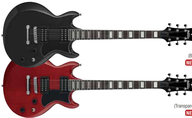
BKN (Black Night) NEW FINISH