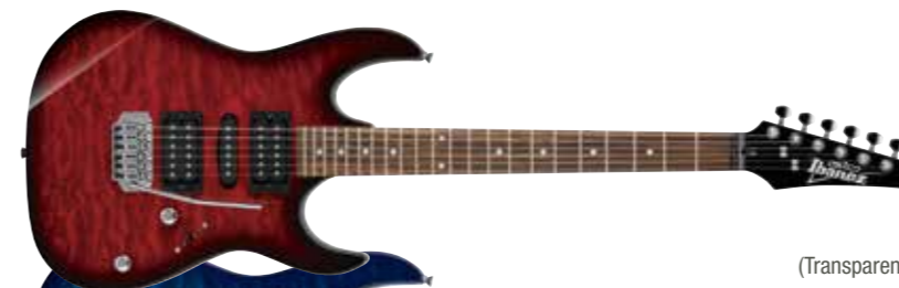
TRB (Transparent Red Burst)