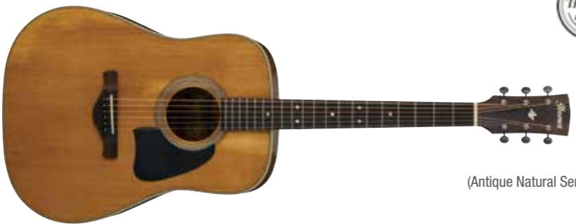
ANS (Antique Natural Semi-Gloss)