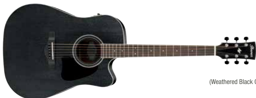
WK (Weathered Black Open Pore)