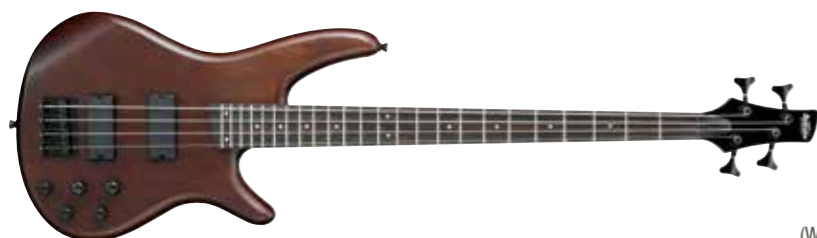
WNF (Walnut Flat)