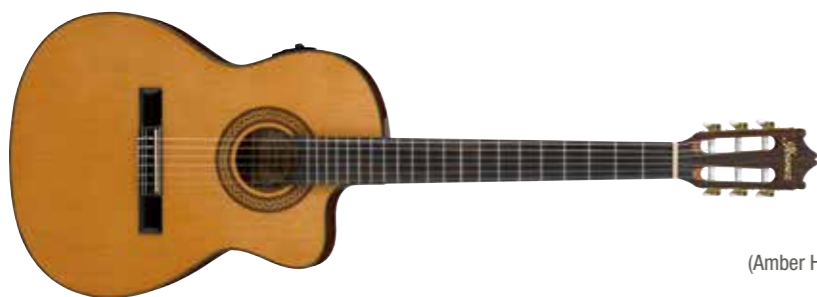
AM (Amber High Gloss)