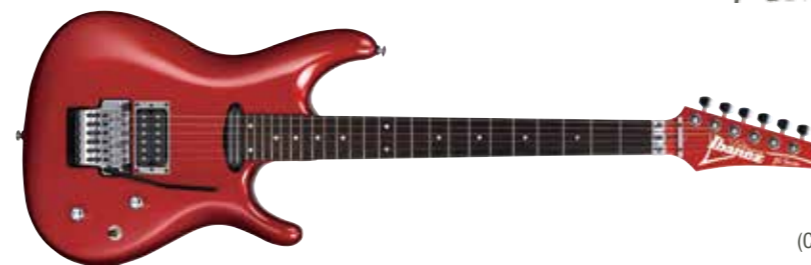
CA (Candy Apple)