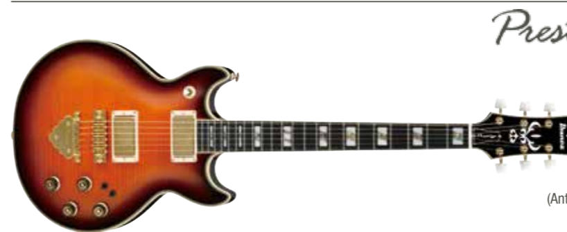
AV (Antique Violin)