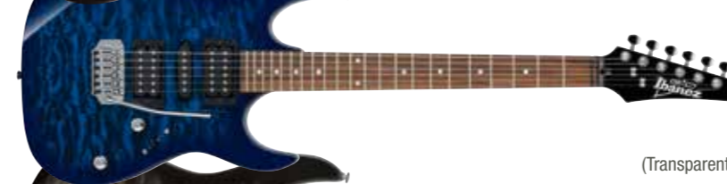
TBB (Transparent Blue Burst)