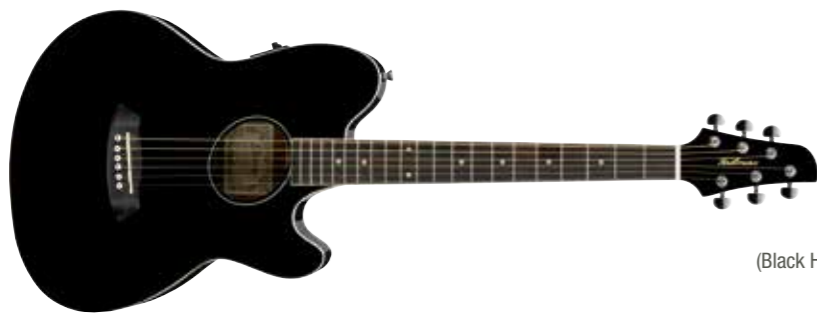
BK (Black High Gloss)