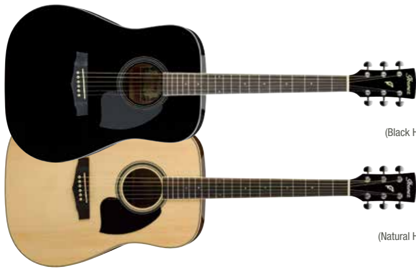
BK (Black High Gloss)