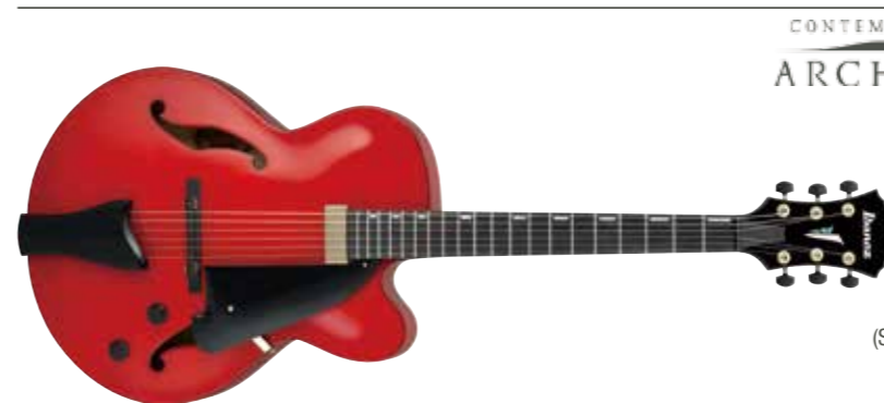
SRR (Sunrise Red)