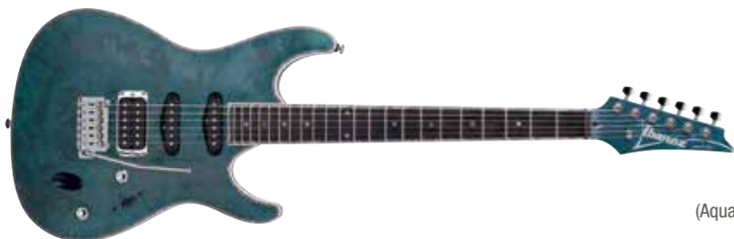
ABT (Aqua Blue Flat)