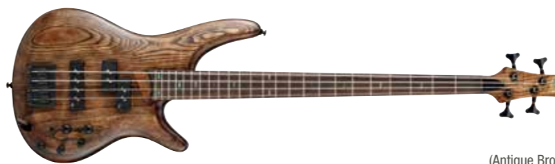
ABS (Antique Brown Stained)