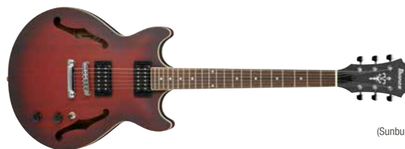
SRF (Sunburst Red Flat)