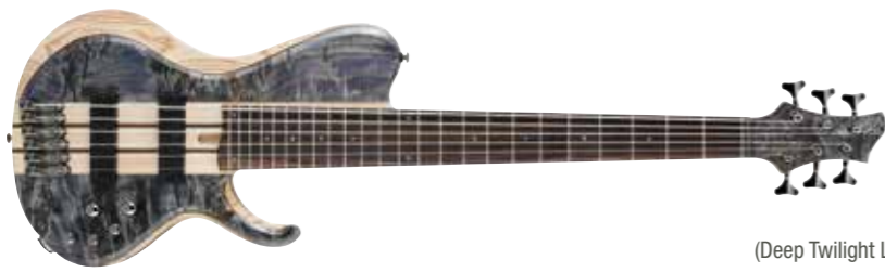
DTL (Deep Twilight Low Gloss)