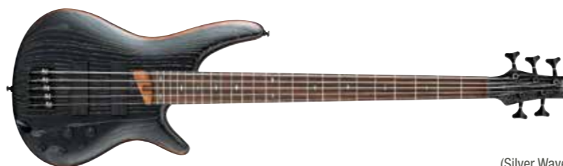
SKF (Silver Wave Black Flat)