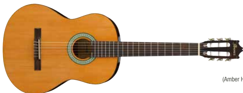
AM (Amber High Gloss)