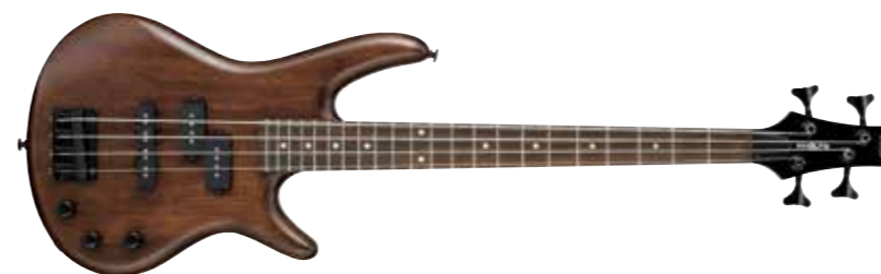
WNF (Walnut Flat)