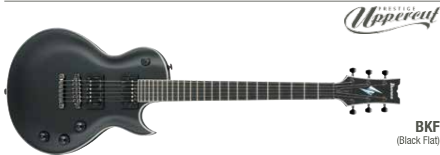
BKF (Black Flat)