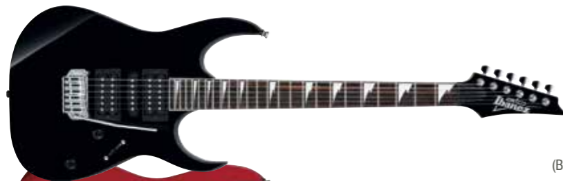
BKN (Black Night)