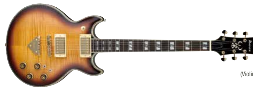
VLS (Violin Sunburst)