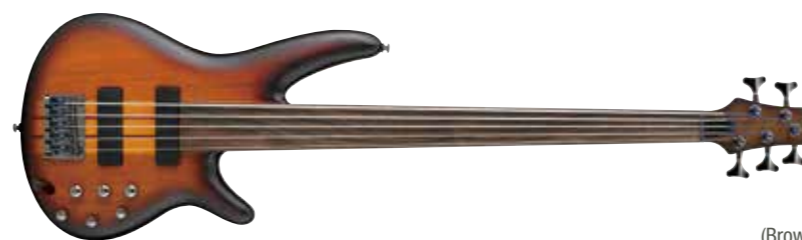
BBF (Brown Burst Flat)