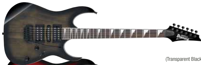
TKS (Transparent Black Sunburst)