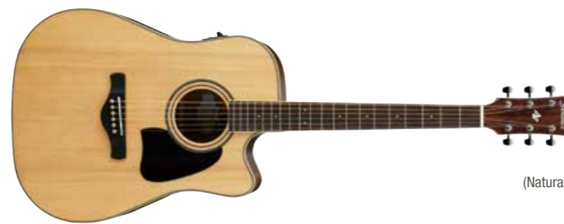
LG (Natural Low Gloss)