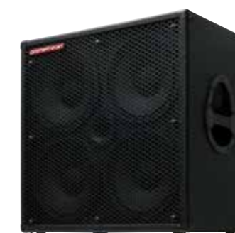
Speaker Cabinet P410CC