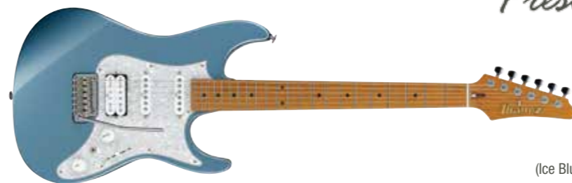
ICM (Ice Blue Metallic)