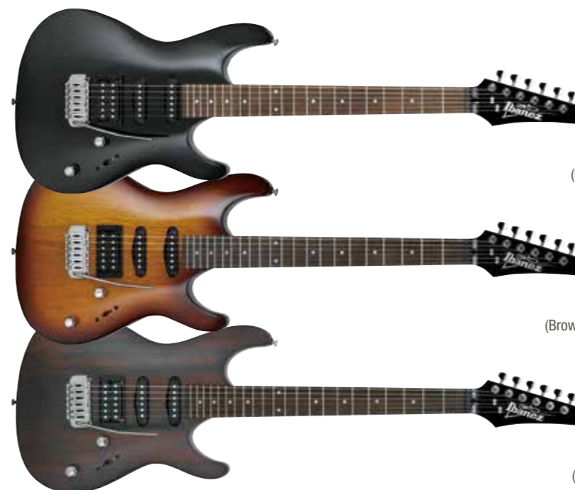
BKN (Black Night)