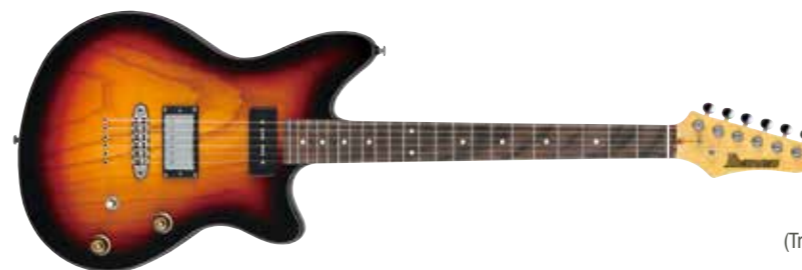
TFB (Tri Fade Burst)