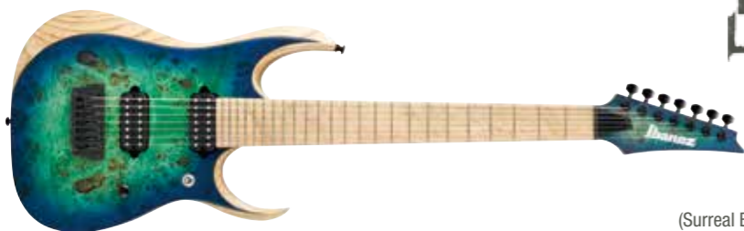
SBB (Surreal Blue Burst)