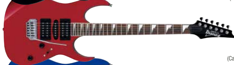
CA (Candy Apple)