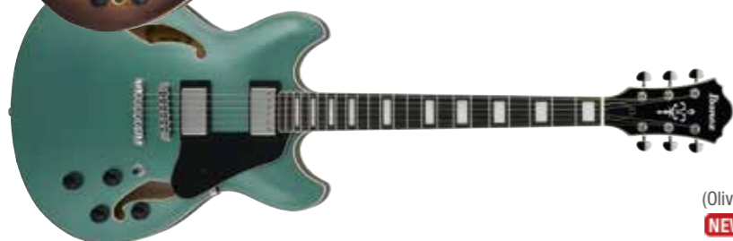
OLM (Olive Metallic) NEW FINISH