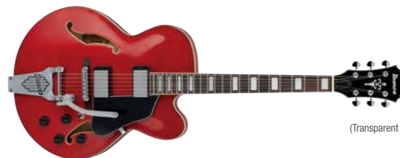
TCD (Transparent Cherry Red)