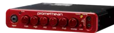
Bass Amplifier Head P300H