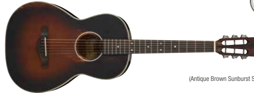
ABS (Antique Brown Sunburst Semi-Gloss)