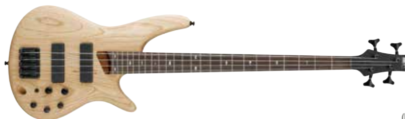
NTF (Natural Flat)