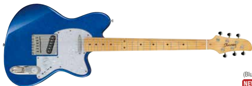
BSP (Blue Sparkle) NEW FINISH