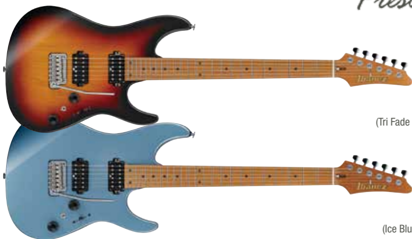
TFF (Tri Fade Burst Flat)