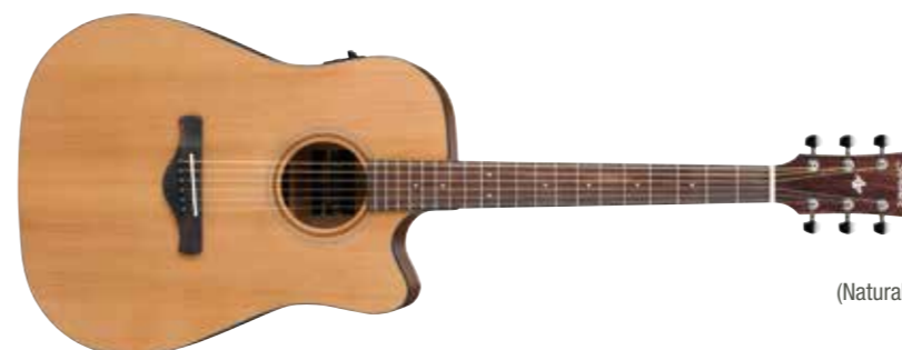
LG (Natural Low Gloss)