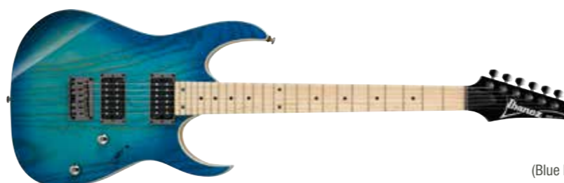
BMT (Blue Moon Burst)