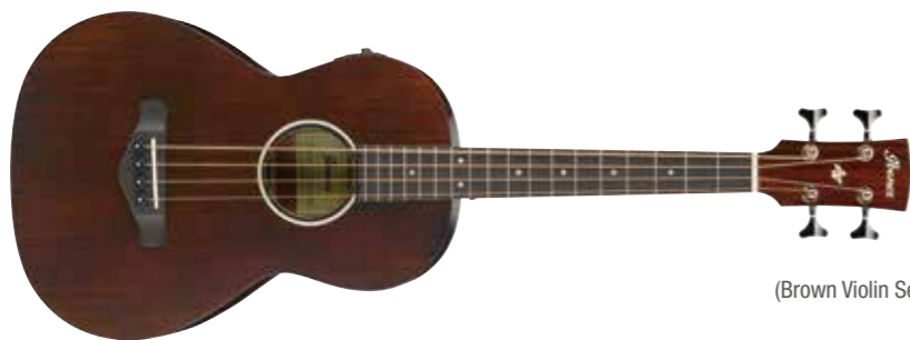
BV (Brown Violin Semi-Gloss)