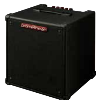
Bass Combo Amplifier P20