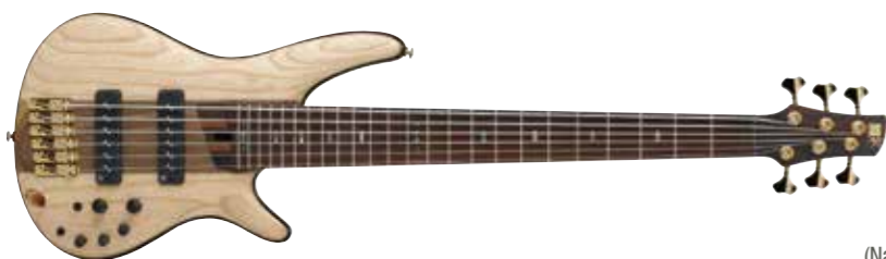
NTF (Natural Flat)