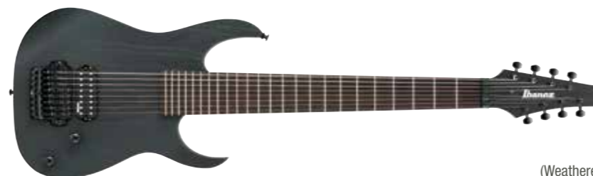
WK (Weathered Black)