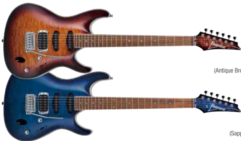
ABB (Antique Brown Burst)