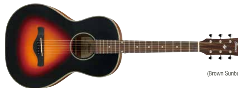
BSM (Brown Sunburst Matte)