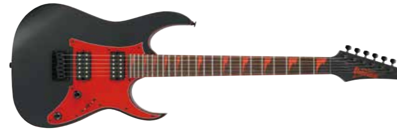
BKF (Black Flat)