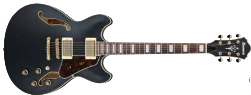
BKF (Black Flat)