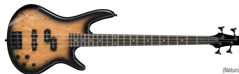
NGT (Natural Gray Burst)