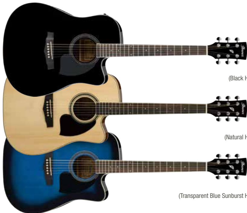
BK (Black High Gloss)