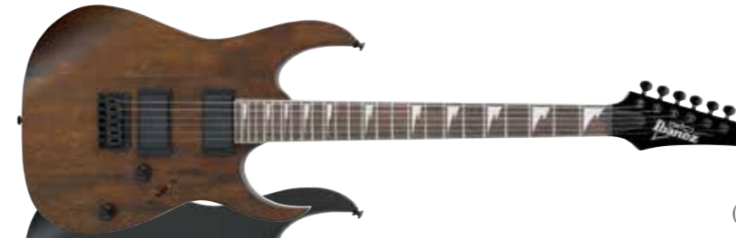
WNF (Walnut Flat)