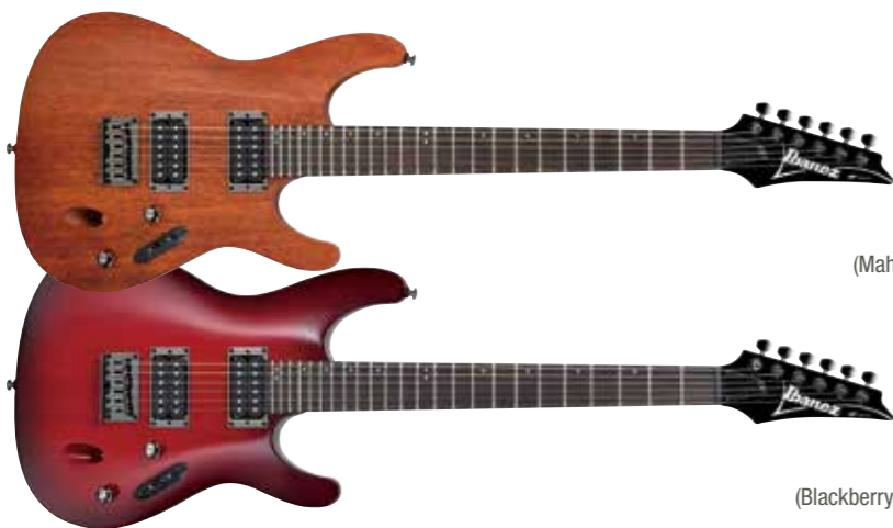
MOL (Mahogany Oil)