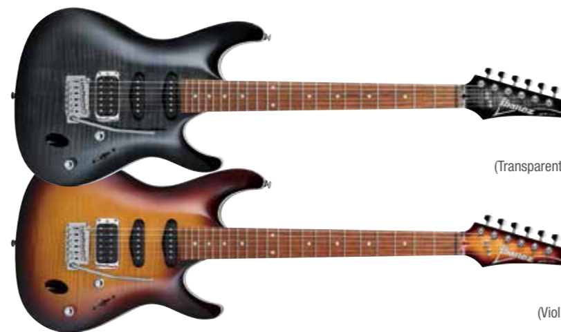
TGB (Transparent Gray Burst)