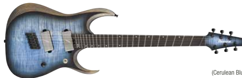
CLF (Cerulean Blue Burst Flat)