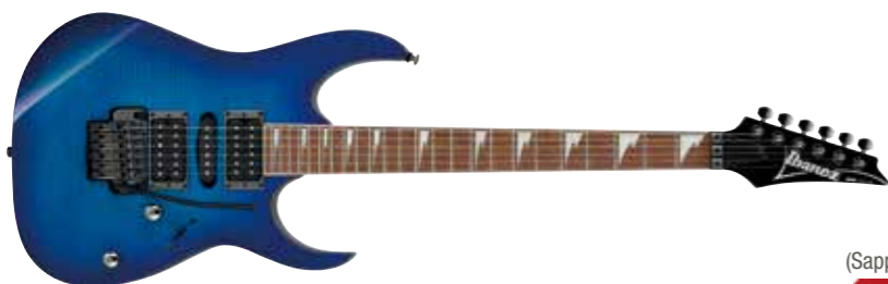
SPB (Sapphire Blue)