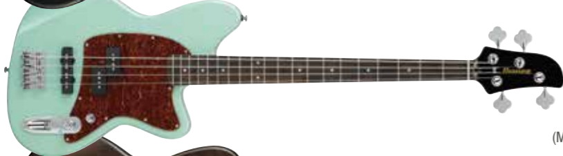
MGR (Mint Green)