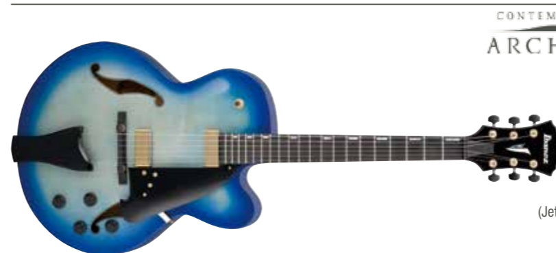
JBB (Jet Blue Burst)