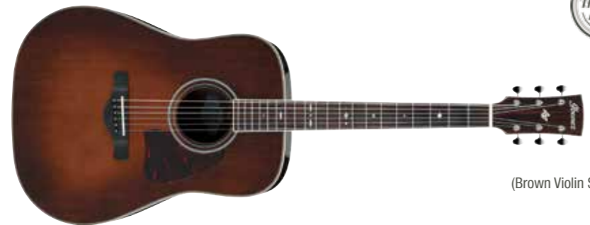
BVS (Brown Violin Sunburst)