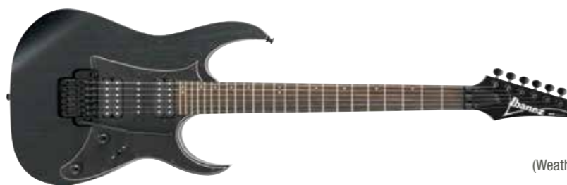
WK (Weathered Black)