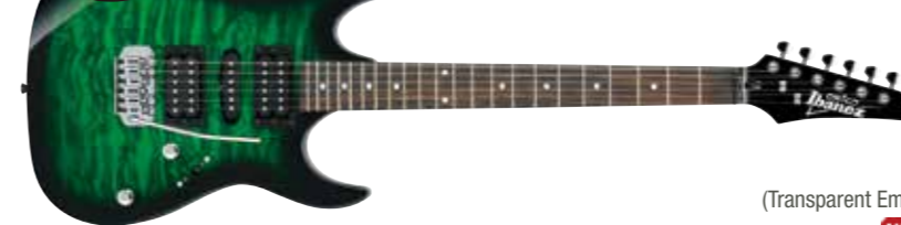
TEB (Transparent Emerald Burst) NEW FINISH