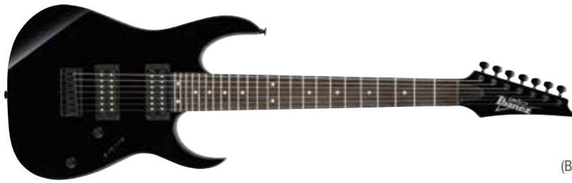
BKN (Black Night)