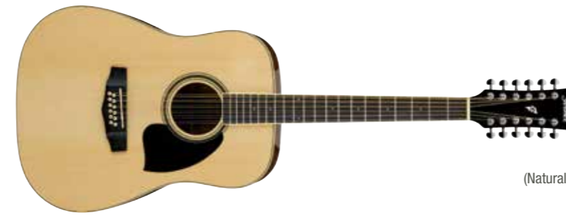
NT (Natural High Gloss)