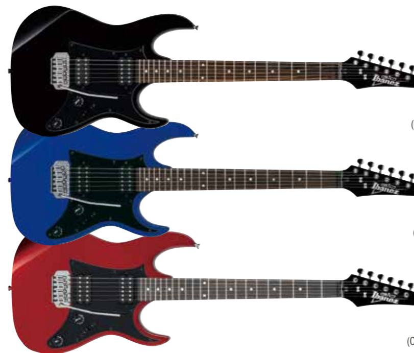
BKN (Black Night)