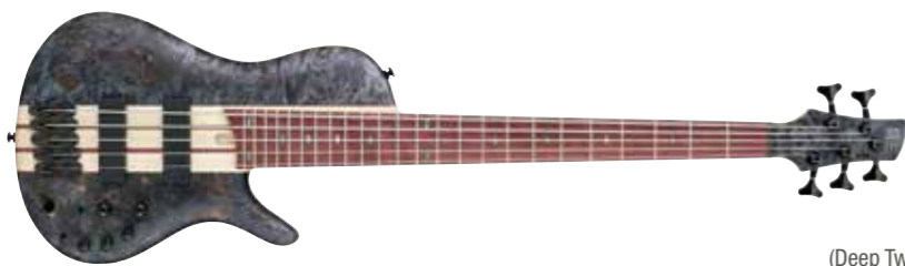
DTF (Deep Twilight Flat)