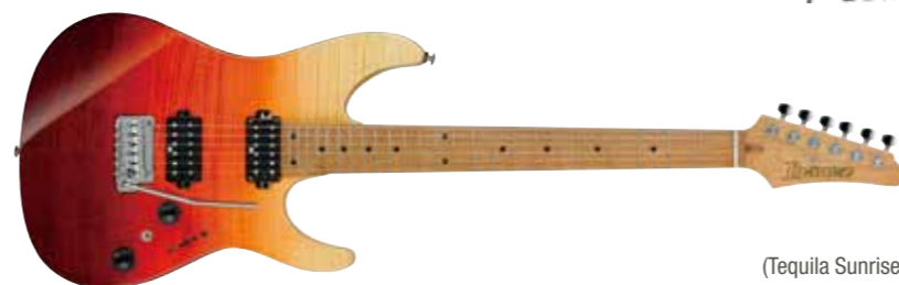
TSG (Tequila Sunrise Gradation)