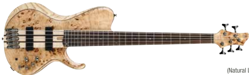
NTL (Natural Low Gloss)