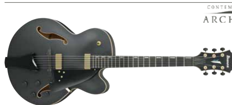
BKF (Black Flat)