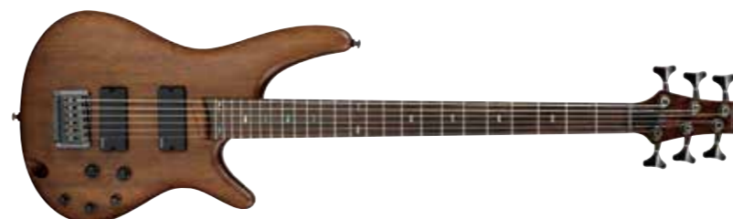
WNF (Walnut Flat)