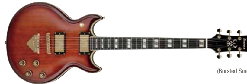
BSQ (Bursted Smoky Quartz)