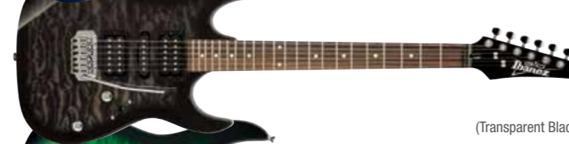
TKS (Transparent Black Sunburst)