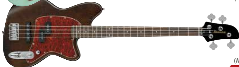
WNF (Walnut Flat)