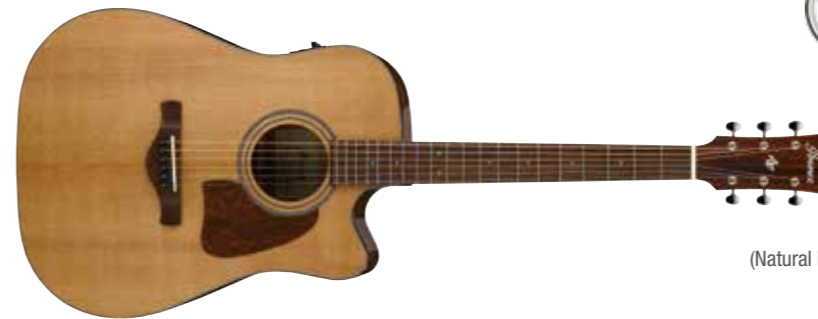
NT (Natural High Gloss)