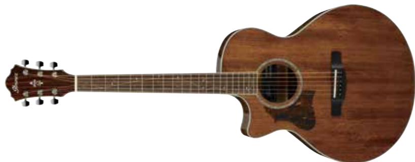
NT (Natural High Gloss)