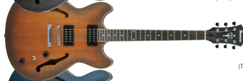
TF (Tobacco Flat)