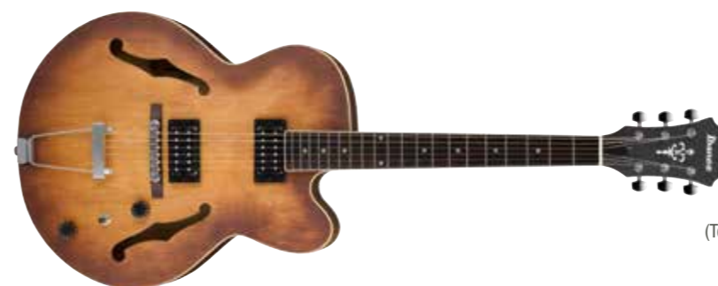
TF (Tobacco Flat)