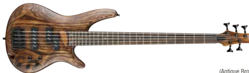
ABS (Antique Brown Stained)