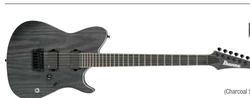
CSF (Charcoal Stained Flat)