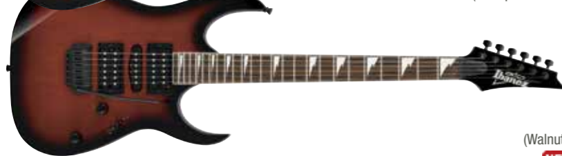
WNS (Walnut Sunburst) NEW FINISH