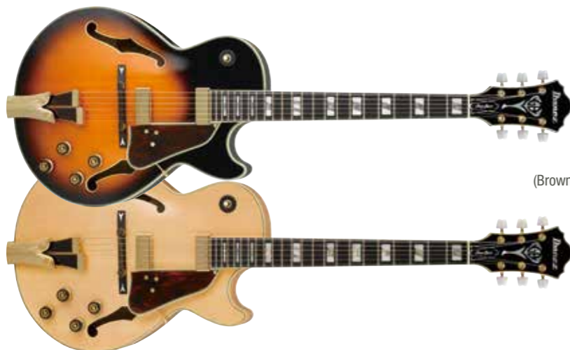
BS (Brown Sunburst)