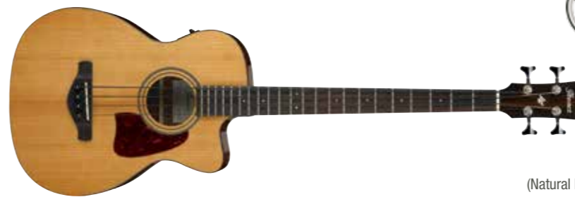
NT (Natural High Gloss)