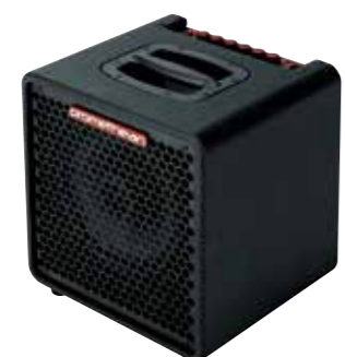
Bass Combo Amplifier P3110