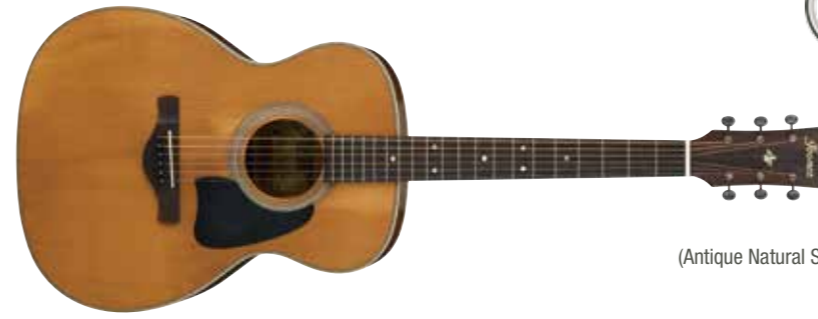
ANS (Antique Natural Semi-Gloss)