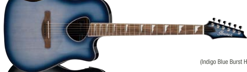
IBB (Indigo Blue Burst High Gloss)