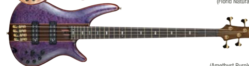
APL (Amethyst Purple Low Gloss)