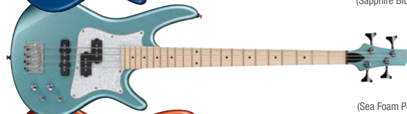
SPN (Sea Foam Pearl Green)