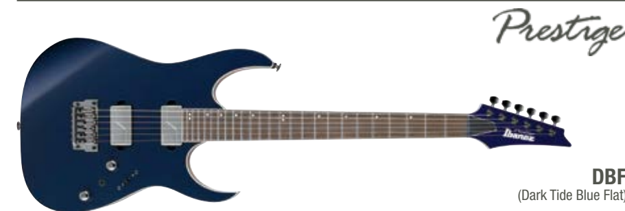
DBF (Dark Tide Blue Flat)