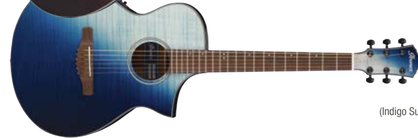
ISF (Indigo Sunset Fade)