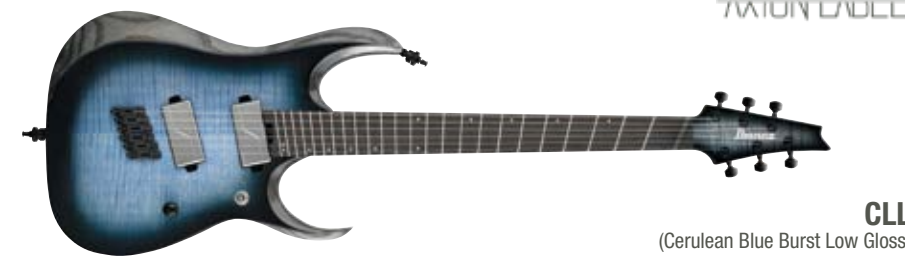
CLL (Cerulean Blue Burst Low Gloss)