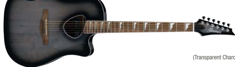
TCB (Transparent Charcoal Burst)