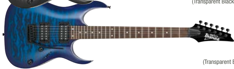
TBB (Transparent Blue Burst)