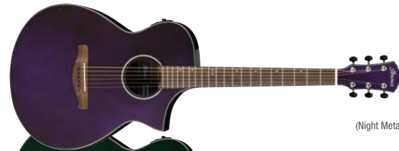
NMP (Night Metallic Purple)