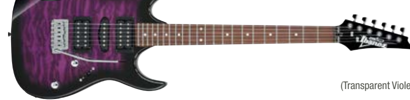
TVT (Transparent Violet Sunburst)