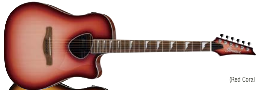
RCS (Red Coral Sunburst)