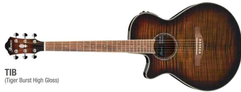
TIB (Tiger Burst High Gloss)