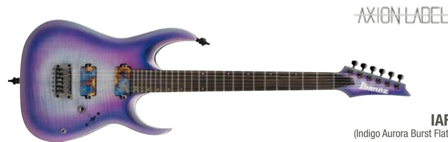
IAF (Indigo Aurora Burst Flat)