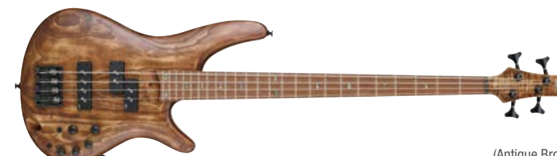
ABS (Antique Brown Stained)