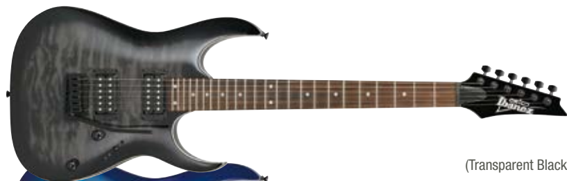
TKS (Transparent Black Sunburst)