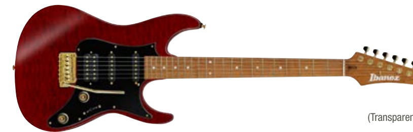
TRM (Transparent Red Matte)