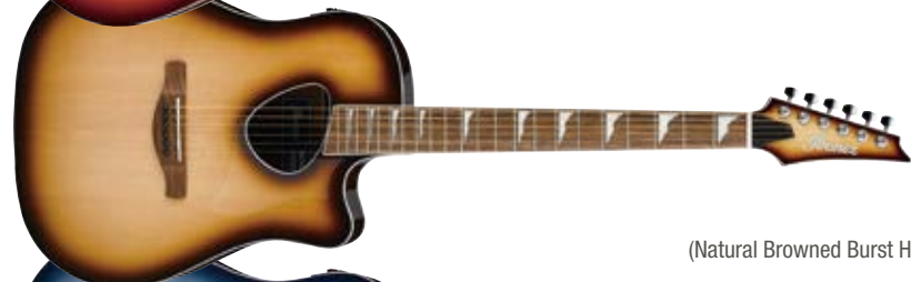
NNB (Natural Browned Burst High Gloss)