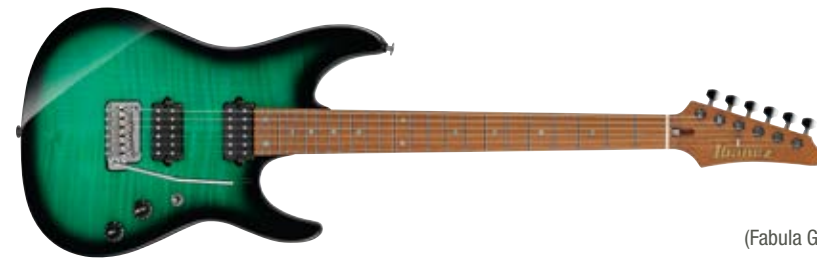
FGB (Fabula Green Burst)