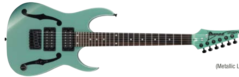
MGN (Metallic Light Green)