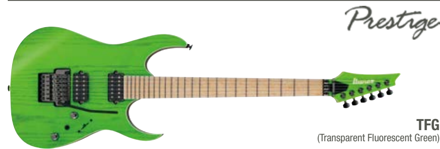
TFG (Transparent Fluorescent Green)