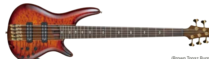
Premium BTL (Brown Topaz Burst Low Gloss)