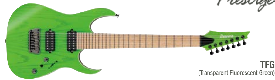
TFG (Transparent Fluorescent Green)