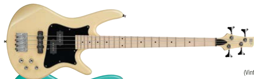
VWH (Vintage White)