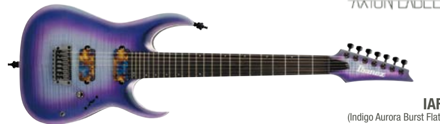
IAF (Indigo Aurora Burst Flat)