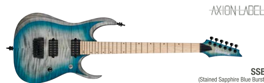
SSB (Stained Sapphire Blue Burst)