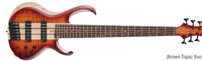
BTL (Brown Topaz Burst Low Gloss)