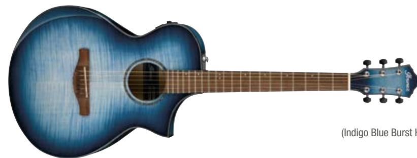
IBB (Indigo Blue Burst High Gloss)