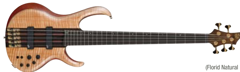
FNL (Florid Natural Low Gloss)