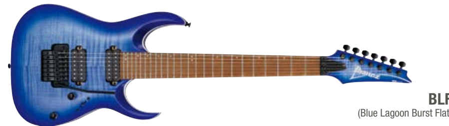
BLF (Blue Lagoon Burst Flat)