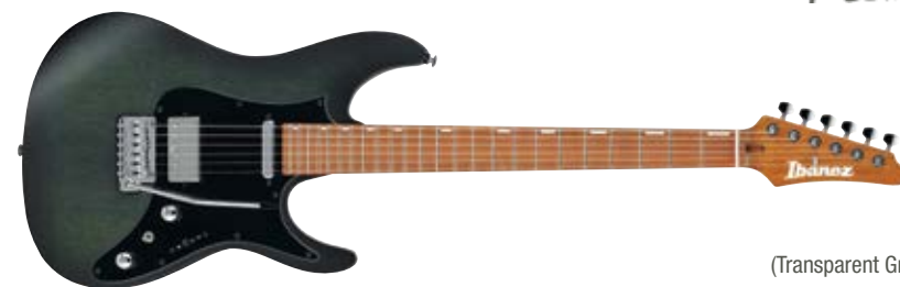
TGM (Transparent Green Matte)