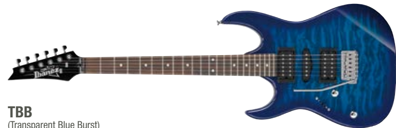
TBB (Transparent Blue Burst)