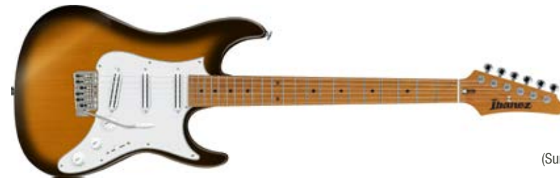
SBT (Sunburst Flat)