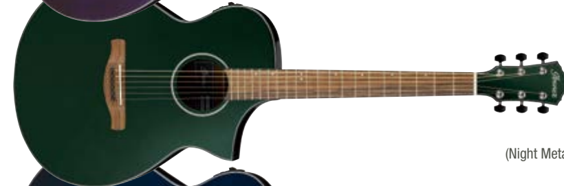
NMG (Night Metallic Green)