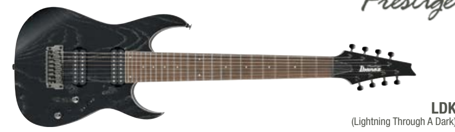
LDK (Lightning Through A Dark)