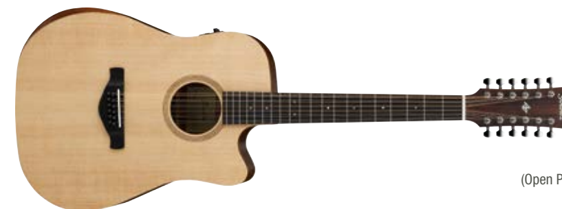
OPN (Open Pore Natural)