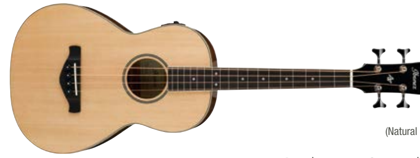
NT (Natural High Gloss)