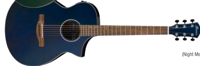
NMB (Night Metallic Blue)