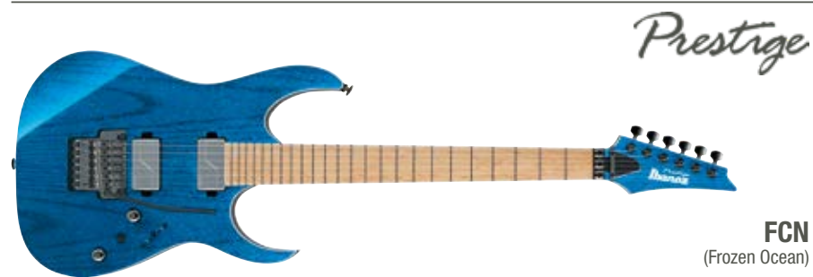
FCN (Frozen Ocean)