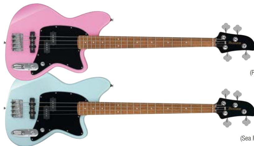
PP (Peach Pink)