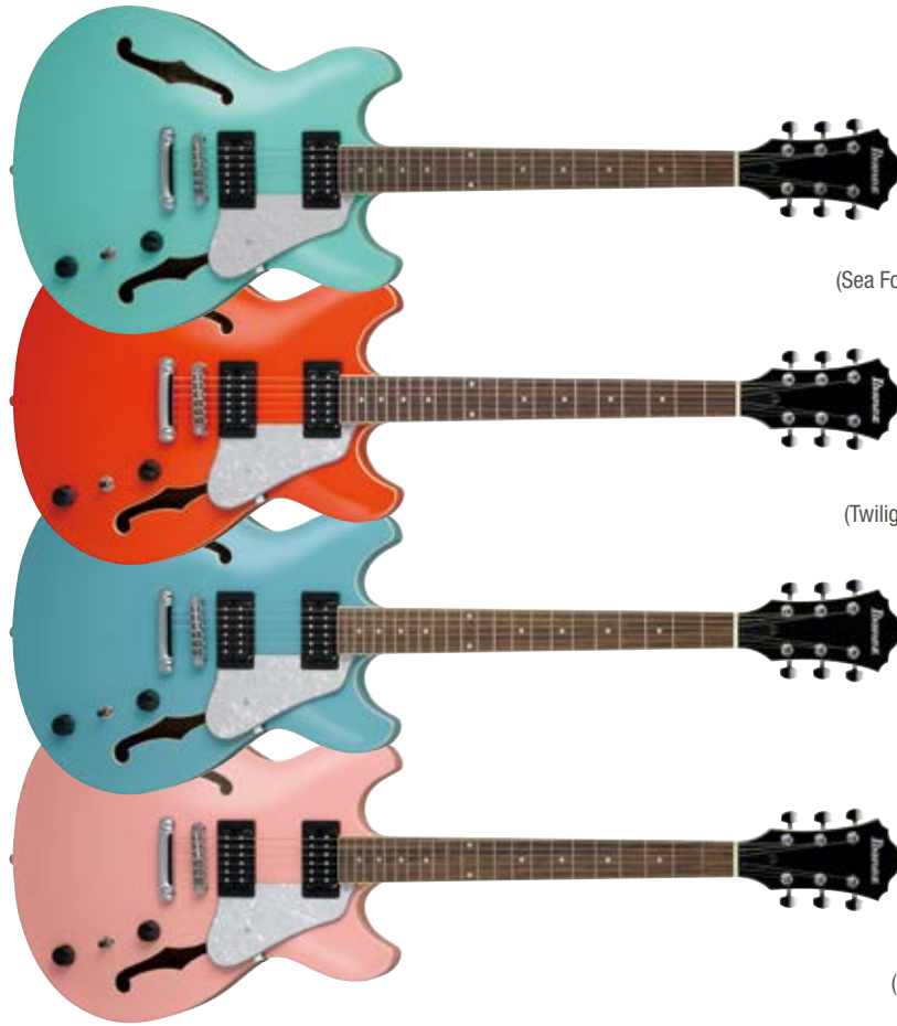
SFG (Sea Foam Green)