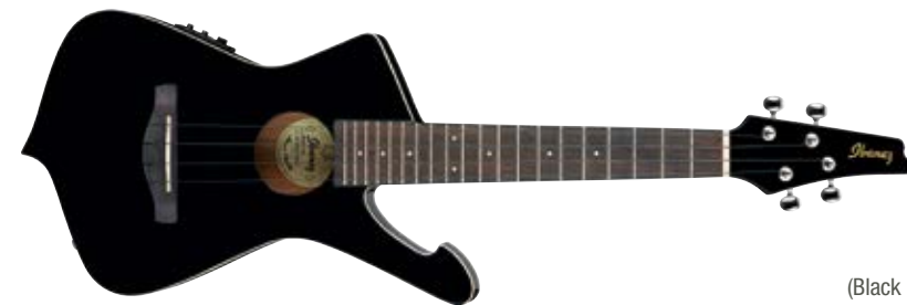
BK (Black High Gloss)