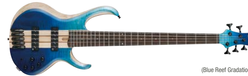
BRL (Blue Reef Gradation Low Gloss)