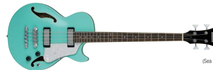
SFG (Sea Foam Green)