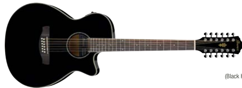
BK (Black High Gloss)