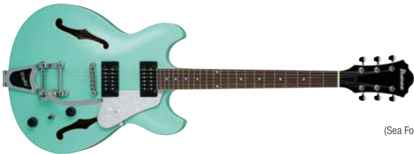
SFG (Sea Foam Green)