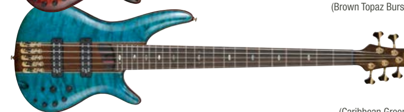
CGL (Caribbean Green Low Gloss)