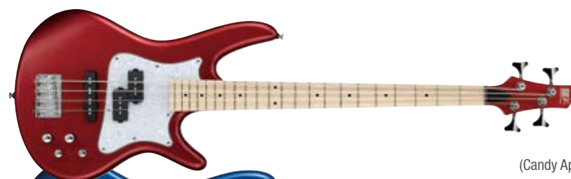
CAM (Candy Apple Matte)