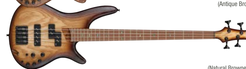
NNF (Natural Brownd Burst Flat)