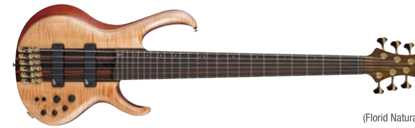
FNL (Florid Natural Low Gloss)