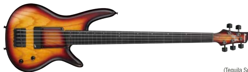
TQF (Tequila Sunrise Flat)

Limited Model Gary Willis 5-STRING Fretless