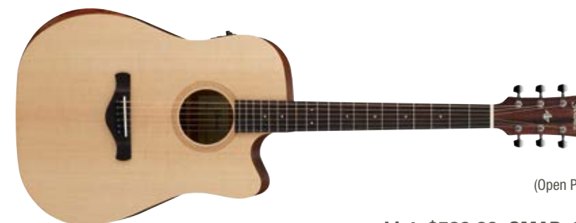
OPN (Open Pore Natural)