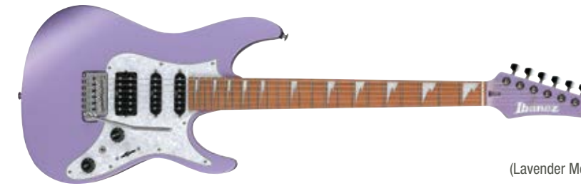
LMM (Lavender Metallic Matte)