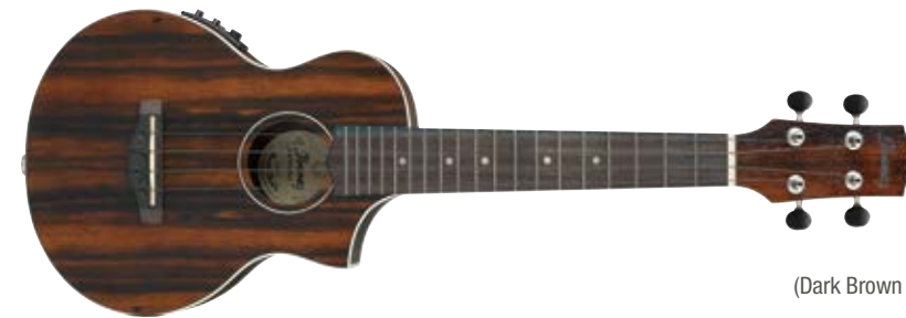
DBO (Dark Brown Open Pore)