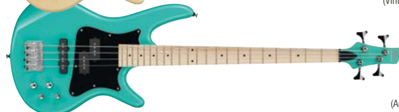
AQG (Aqua Green)