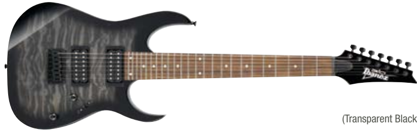
TKS (Transparent Black Sunburst)