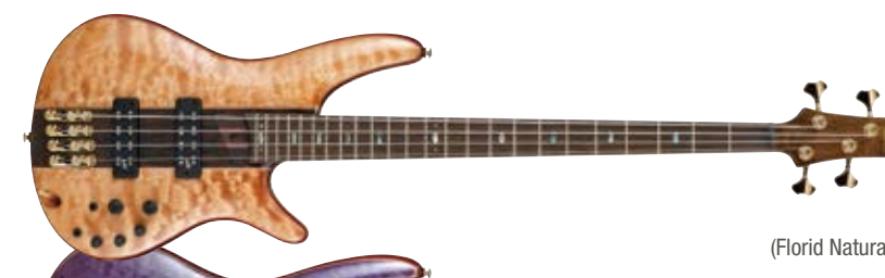
Premium FNL (Florid Natural Low Gloss)