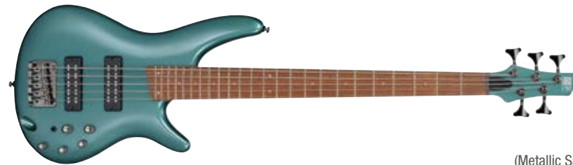
MSG (Metallic Sage Green)