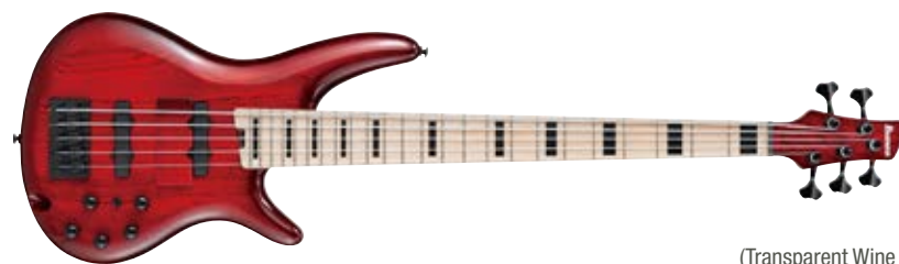
TWB (Transparent Wine Red Burst)