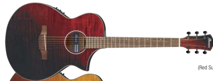
RSF (Red Sunset Fade)