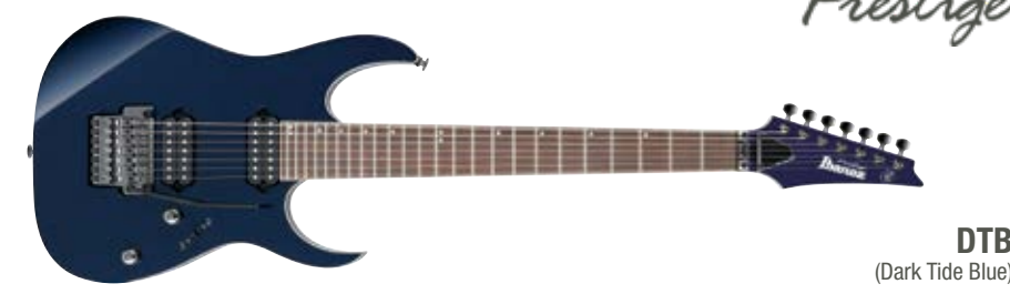
DTB (Dark Tide Blue)