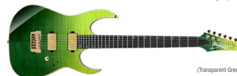
TGG (Transparent Green Gradation)