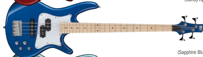
SBM (Sapphire Blue Metallic)