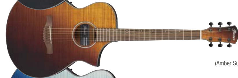
ASF (Amber Sunset Fade)