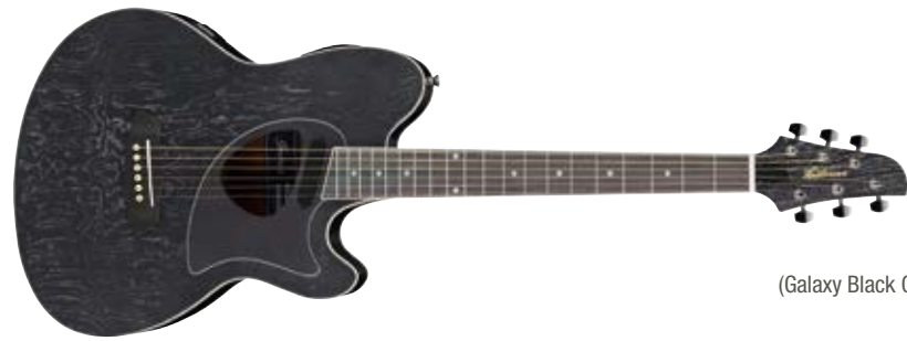
GBO (Galaxy Black Open Pore)