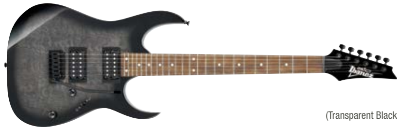
TKS (Transparent Black Sunburst)