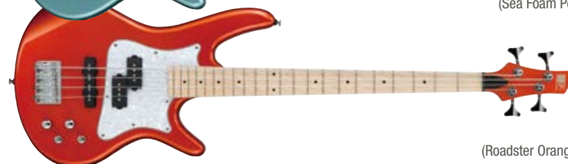
ROM (Roadster Orange Metallic)