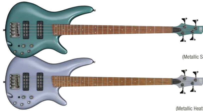
MSG (Metallic Sage Green)