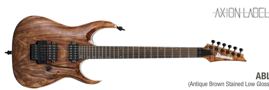
ABL (Antique Brown Stained Low Gloss)