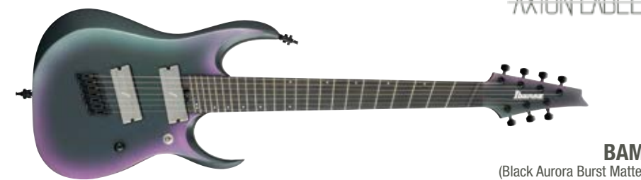
BAM (Black Aurora Burst Matte)