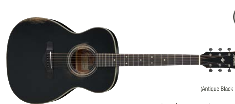
ABK (Antique Black Semi-Gloss)