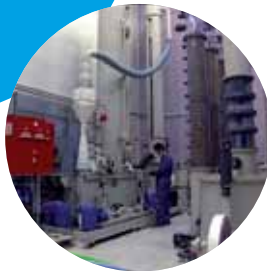
Pilot hall of more than 200 m 2