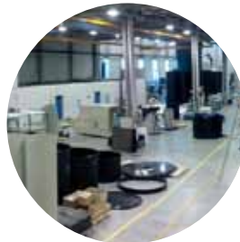
More than 8400 m 2 workshop in France