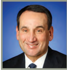
Mike Krzyzewski Head Coach Duke University Men's Basketball Team