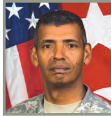
GEN Vincent K. Brooks Commanding General United States Army Pacific