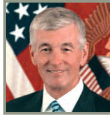
HON John M. McHugh Secretary of the Army