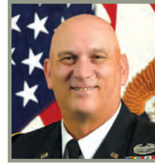
GEN Raymond T. Odierno Chief of Staff United States Army