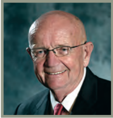
GEN Gordon R. Sullivan United States Army Retired President and CEO AUSA