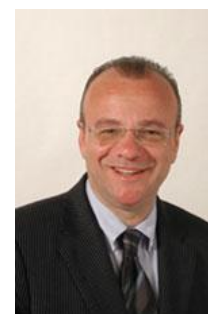
Gianfranco Rotondi Minister of Policy Realization

Here is a list of all ministries and state secretariats, with respective contact details: