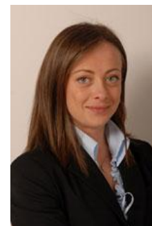
Giorgia Meloni Minister of Youth Policies