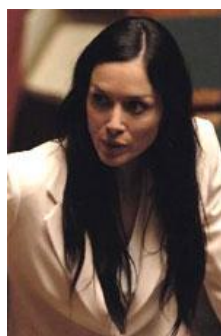
Mara Carfagna Minister of Equal Opportunities