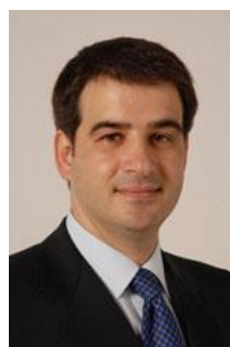
Raffaele Fitto Minister for Relations with the Regions