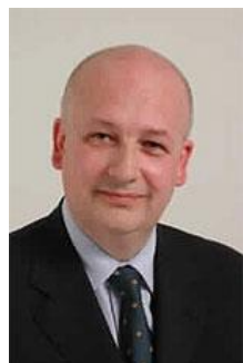
Sandro Bondi Minister of Cultural Heritage