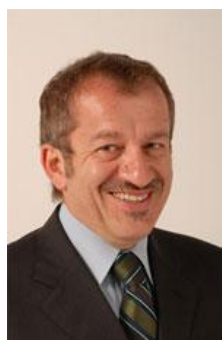
Roberto Maroni Minister of the Interior