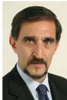
Ignazio La Russa Minister of Defence