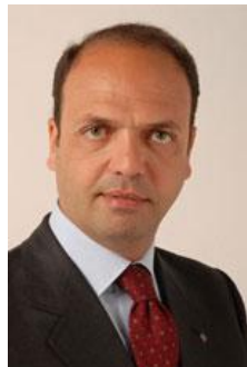
Angelino Alfano Minister of Justice