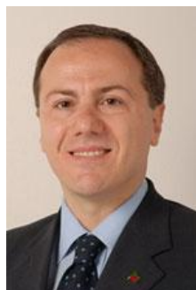
Alfredo Vito Minister for Relations with the Parliament