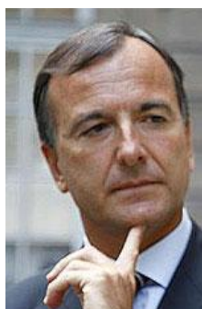
Franco Frattini Foreign Minister