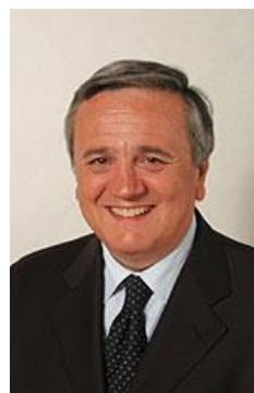
Guido Sacconi Minister of Welfare, Health and Labour