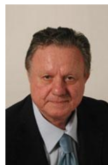
Altero Matteoli Minister of Infrastructure