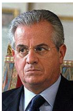
Claudio Scajola Minister of Economic Development