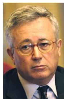
Giulio Tremonti Minister of Economy