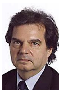
Renato Brunetta Minister of Public Administration and Innovation