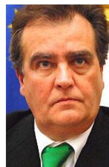
Roberto Calderoli Minister of Streamlining