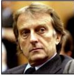
President: Luca de Montezemolo

Luca Cordero di Montezemolo (*1947) is president of Ferrari and chairman of FIAT. Born in Bologna, Montezemolo studied at the University of Rome La Sapienza and at Columbia University in New York. In 1971, before completing his studies, he drove briefly for the famous and privately owned Lancia rally team. Upon completing his academic career he joined FIAT. In 1973 FIAT moved him to Ferrari, where he promptly became Enzo Ferrari's assistant.