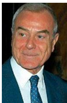
Gianni Letta Undersecretary