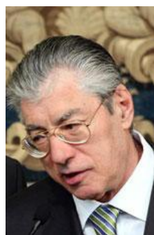
Umberto Bossi Minister of Reforms