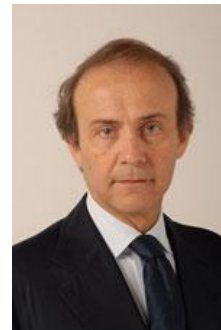
Andrea Ronchi Minister of European Affairs