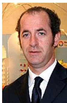
Luca Zaia Minister of Agriculture