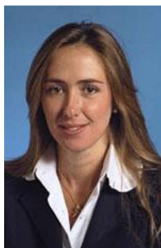
Stefania Prestigiacomo Minister of the Environment