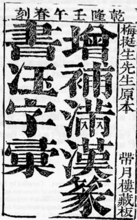
Zengbu Man-Han zhuanzihui 增補滿漢篆字彙 (RM CK494.13 166): title-page.