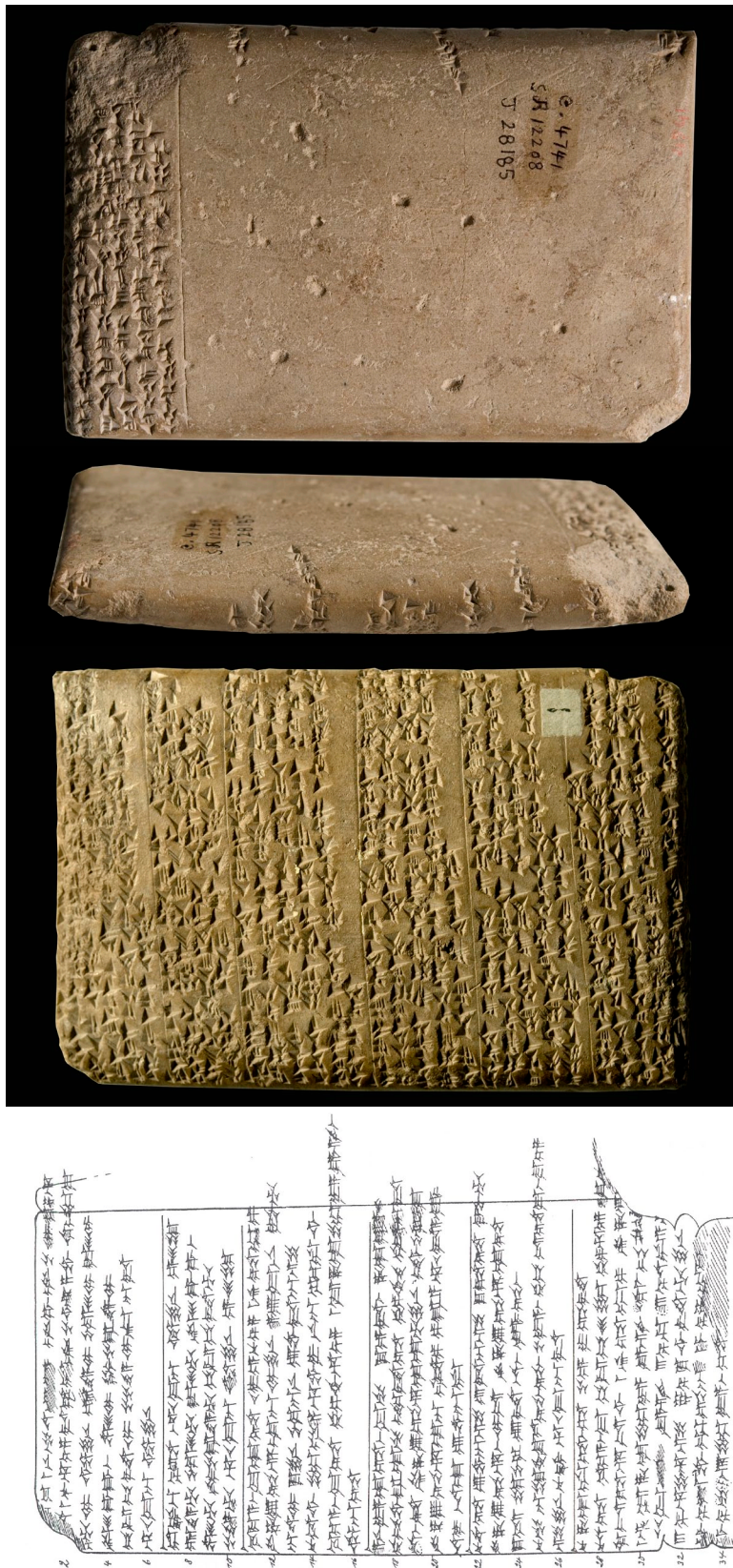
Fig. 2: Cuneiform copy after Götz 1930, no. 1. Recto, side and verso of fired clay tablet from el-Amarna (EA 31). Egyptian Museum, Cairo JE 12208 (CG 4741).