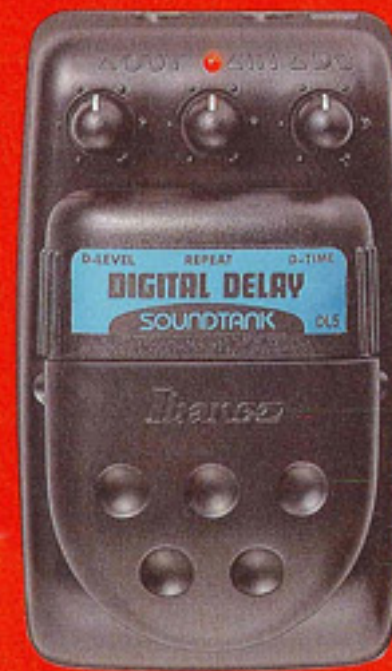
DIGITAL DELAY DL5

Analog circuitry for warm, lush chorusing.