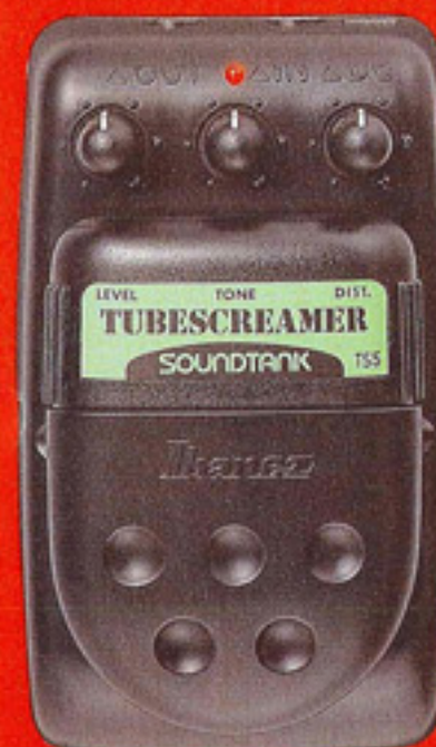
TUBE SCREAMER TS5

Screaming, overpowering, headbanger distortion!