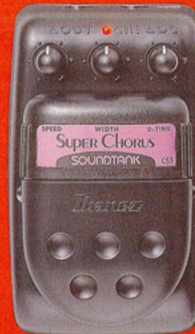
SUPER CHORUS CS5

A must for smoothing out high gain leads and rhythm playing.