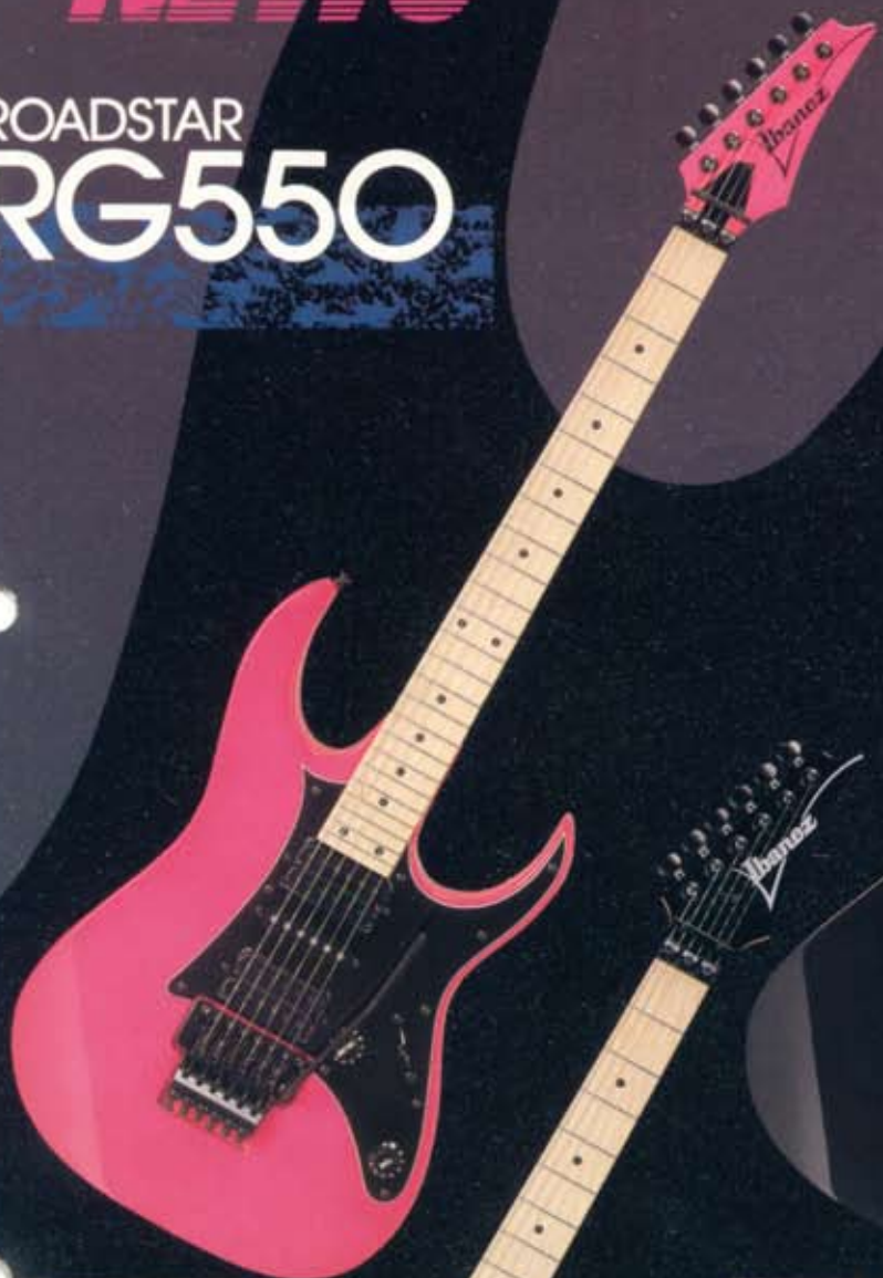
RG550RF (ROAD FLARE RED)