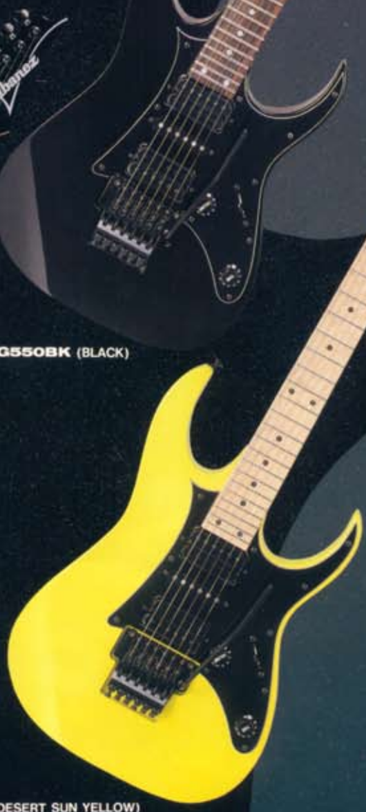
RG550DY (DESERT SUN YELLOW)