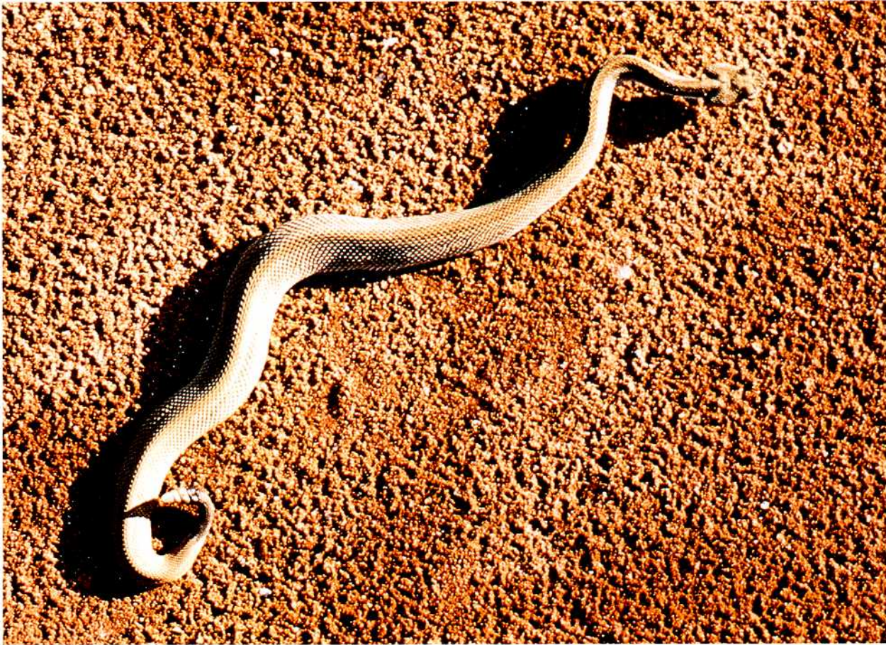
Fig. 1. Aberrantly patterned juvenile western diamondback rattlesnake acquired from Haskell County, Texas. Faint longitudinal stripe appears to be the result of blotch pattern transformation. Snout to vent length of this specimen is 450 mm.

northern pacific rattlesnake ( C. v. oreganus ), the southern pacific rattlesnake ( C. v. helleri ), the Panamint rattlesnake ( C. mitchellii stephensi ) (Klauber, 1972), and the western massasauga ( Sistrurus catenatus tergimimus ) (Irwin, 1979). However, in aberrant individuals of these taxa, the longitudinal stripe only extends two-thirds the length of the body or less (Klauber, 1972; Irwin, 1979). Complete blotch transformation (longitudinal stripe from head to tail) in rattlesnakes formerly was known only on the basis of four individuals. One was a timber rattlesnake ( C. horridus ) reported by Gloyd (1935). Interestingly, the other three were western diamondbacks from Texas, one from Bexar County, one from adjacent Comal County, and the other from an unknown place in southeast Texas (Gloyd, 1958; Klauber, 1972). In addition, Tennant (1984) reported that in 1981 two "almost patternless cinnamon-gray" specimens were collected from the Williamson County area of Texas, which