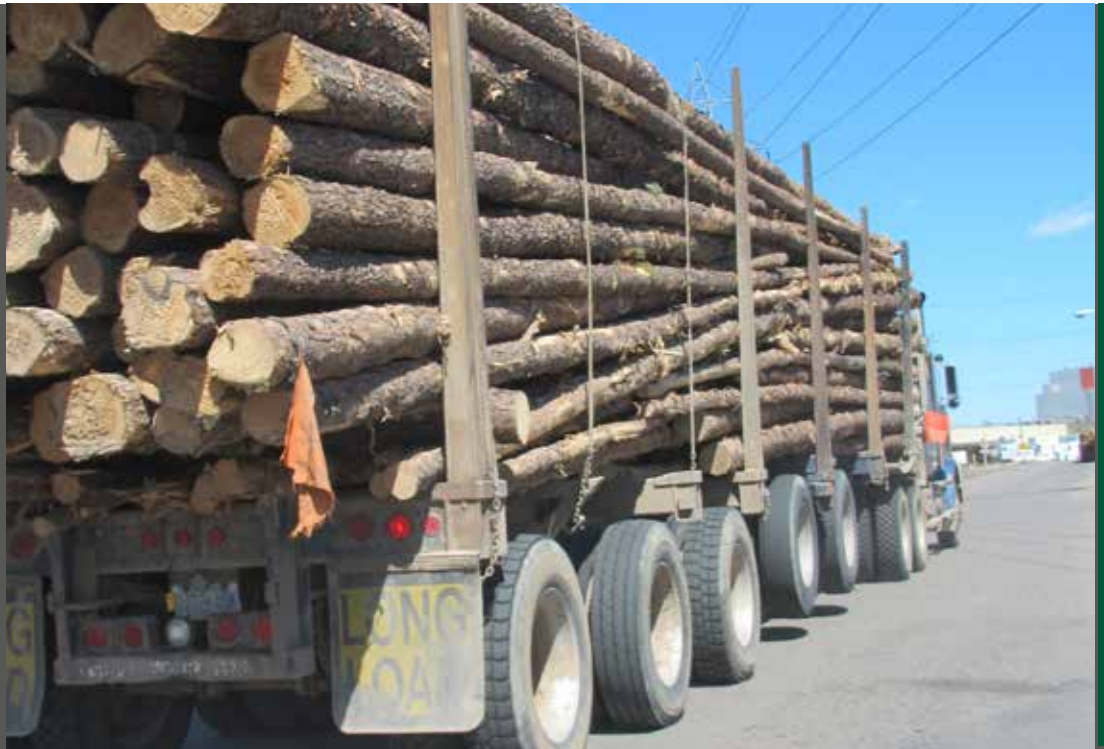
image: There is a high risk that wood on this truck destined for the Thunder Bay mill comes from threatened woodland caribou habitat.