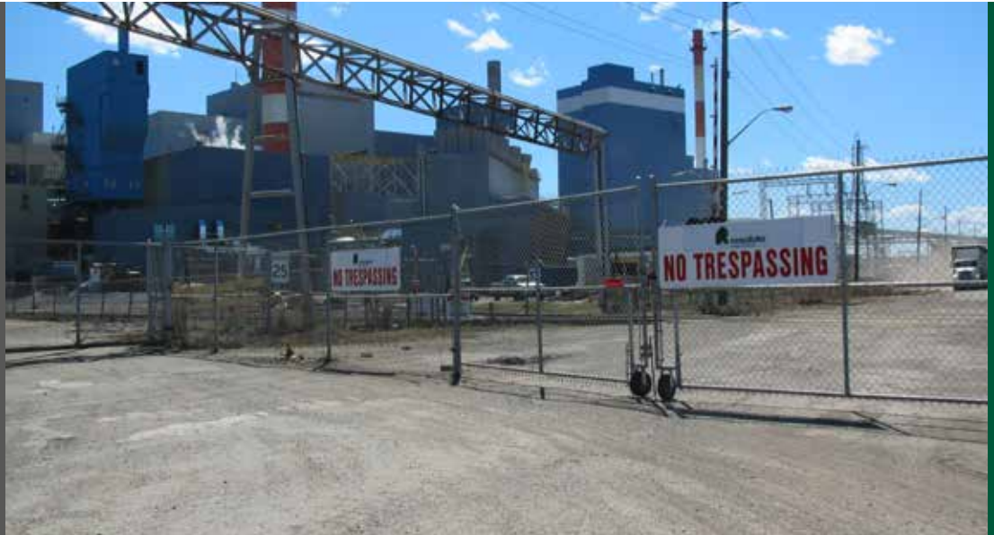
image: Resolute's Thunder Bay mill is able to mix or link controversial wood with FSC-certified material, putting the integrity of the FSC label at risk.