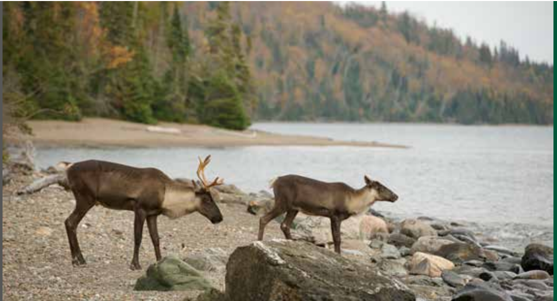
image: The threatened woodland caribou is being pushed to extinction because of destructive logging practices and other industrial developments.

In Ontario, where the Thunder Bay mill complex is located, there are insufficient protected areas in place to prevent the decline of the majority of woodland caribou herds. In fact, Ontario does not contain a single protected area that is large enough to ensure long-term caribou survival. 9 The Government of Ontario's own Woodland Caribou Science Panel found the province's approach to conserving caribou populations was "bound to result in failure to recover caribou populations," including its failure to adequately protect habitat areas. 10