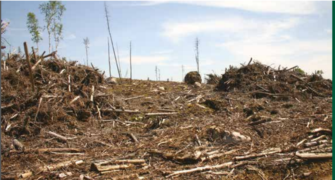
image: An example of a clearcut carried out on Grassy Narrows First Nation traditional land without consent in 2006