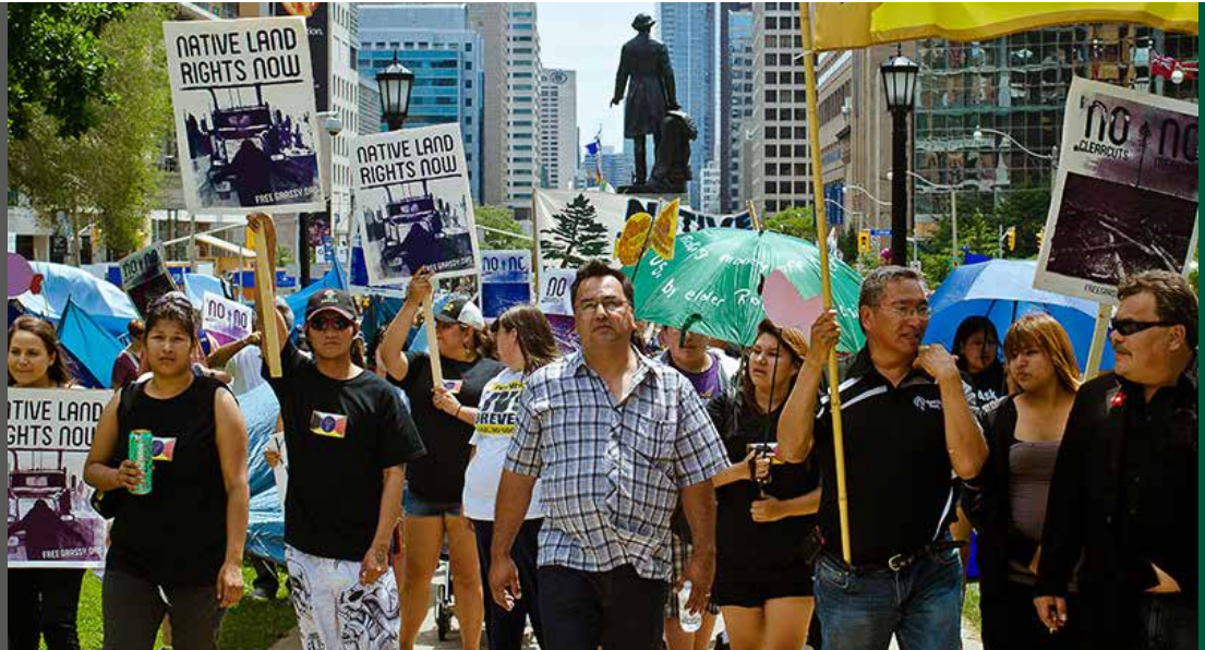
image: Grassy Narrows First Nation and supporters rally in Toronto against logging without consent on their traditional territories. June 2012

Resolute has clearly ignored two main low-risk indicators related to the CW social category wood, including: (i) a recognised dispute resolution process by affected parties to resolve conflicts of substantial magnitude pertaining to traditional rights; and (ii) there is no evidence of violation of the ILO Convention 169 on Indigenous and Tribal Peoples taking place in the forest areas in the district concerned.