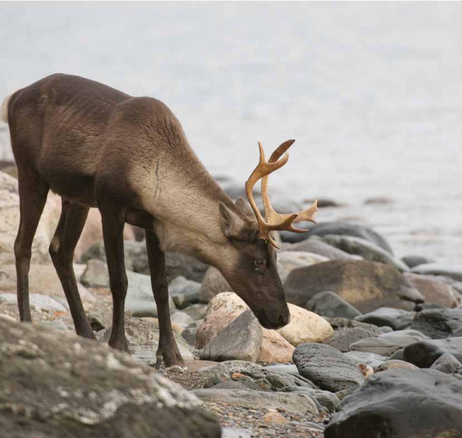
image: The threatened woodland caribou is extremely sensitive to disturbances such as clearcuts and roads