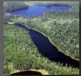
image: Intact forests like this one are increasingly at risk from industrial-scale logging.

Now FSC supporters need to work together to keep the FSC strong as it continues to grow.